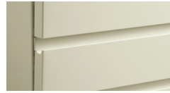
Steel J - Pull