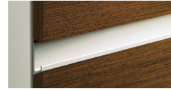
Wood J - Pull