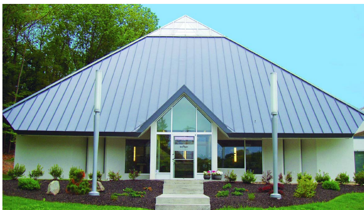
The SELUX full service manufacturing facility in New York

At se'lux we believe in a systems approach. Each design features a variety of mounting configurations and shielding options. This system-oriented flexibility allows for a tremendous variety of visual and photometric effects.