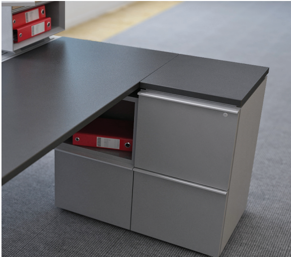
Full pull detail.