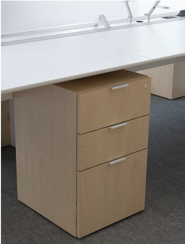
Tab pull detail.