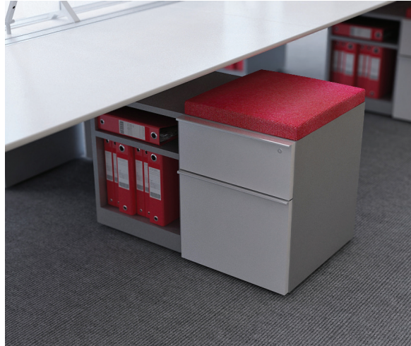
Full pull and bookcase detail.