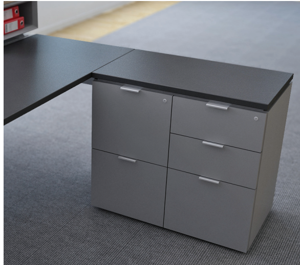
Tab pull detail.