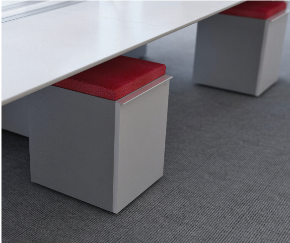
Full pull detail.