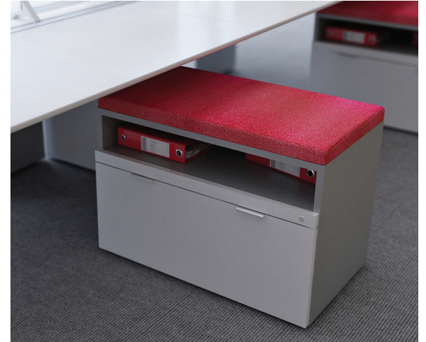
Tab pull and cubby option.