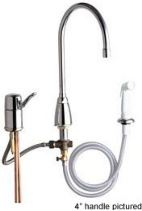
4" handle pictured