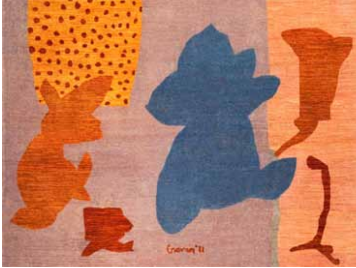
Arabesque 1 SIZE: 8'x6' / MSRP: $6,000.00