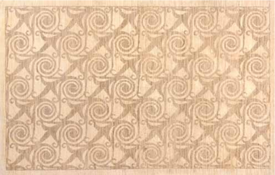
VOLUTE 9'x12' / MSRP: $14,000.00 SIZE: 8'x10' / MSRP: $10,000.00 SIZE: 5'x7'6" / MSRP: $4,500.00

“The volutes of an Ionic capital interweave with unfurling tendrils to create a climbing, spinning grapevine that is at once geometric and botanical, modern and Classical.”