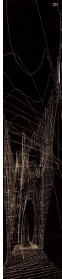
ZH SIZE: 3'x14' / MSRP: $6,900.00