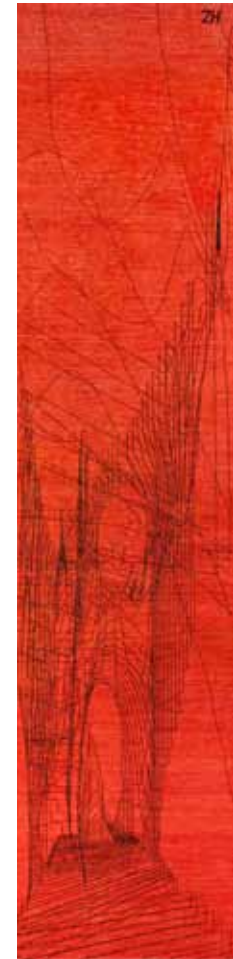
ZH SIZE: 3'x14' / MSRP: $6,900.00

“A seamless domestic environment, depicted in perspective as a series of cuts through time and space, has been woven into this rug, evoking a new typology of living in the future.”