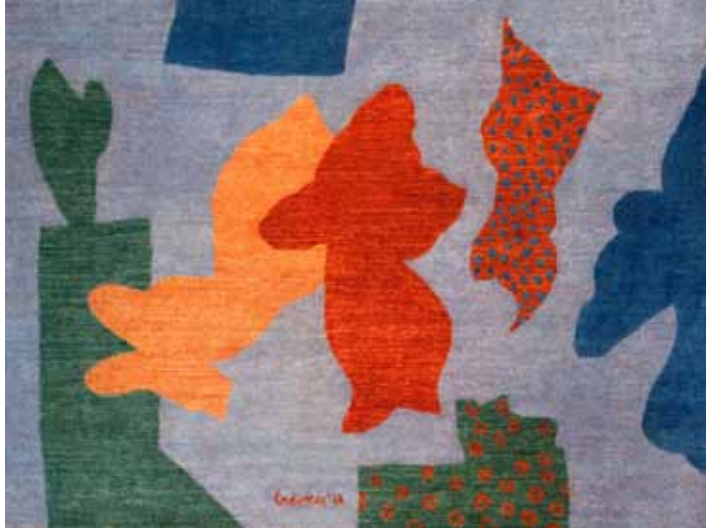
Arabesque 2 SIZE: 8'x6' / MSRP: $6,000.00