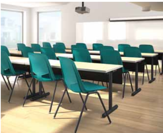
Learn With Us .