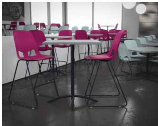
Collaborate With Us .