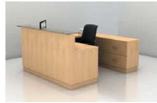
Shown with: - Inlay Front Panel - Stone Transaction Top Option