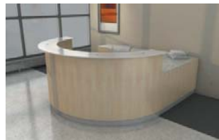
Shown with: - Plain Front Panel - Glass Transaction Top Option