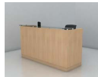
Shown with: - Plain Front Panel - Glass Transaction Top Option