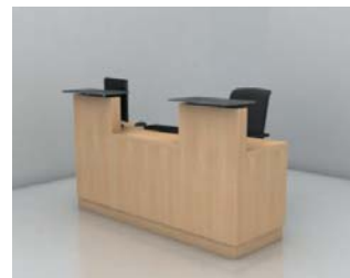
Shown with: - Plain Front Panel - Stone Transaction Top Option