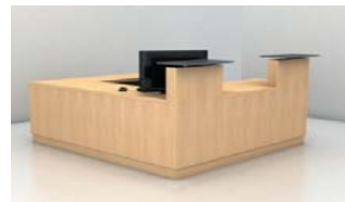
Shown with: - Plain Front Panel - Stone Transaction Top Option