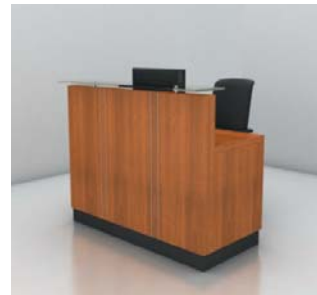
Shown with: - Inlay Front Panel - Glass Transaction Top Option