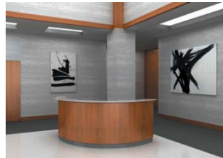
Shown with: - Plain Front Panel - Glass Transaction Top Option