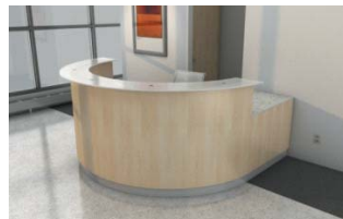
Shown with: - Plain Front Panel - Glass Transaction Top Option