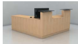
Shown with: - Plain Front Panel - Stone Transaction Top Option