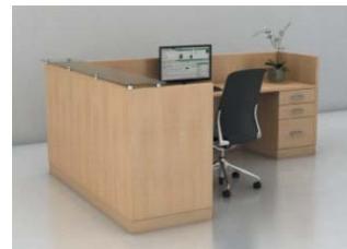
Shown with: - Plain Front Panel - Glass Transaction Top Option