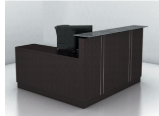
Shown with: - Inlay Front Panel - Stone Transaction Top Option