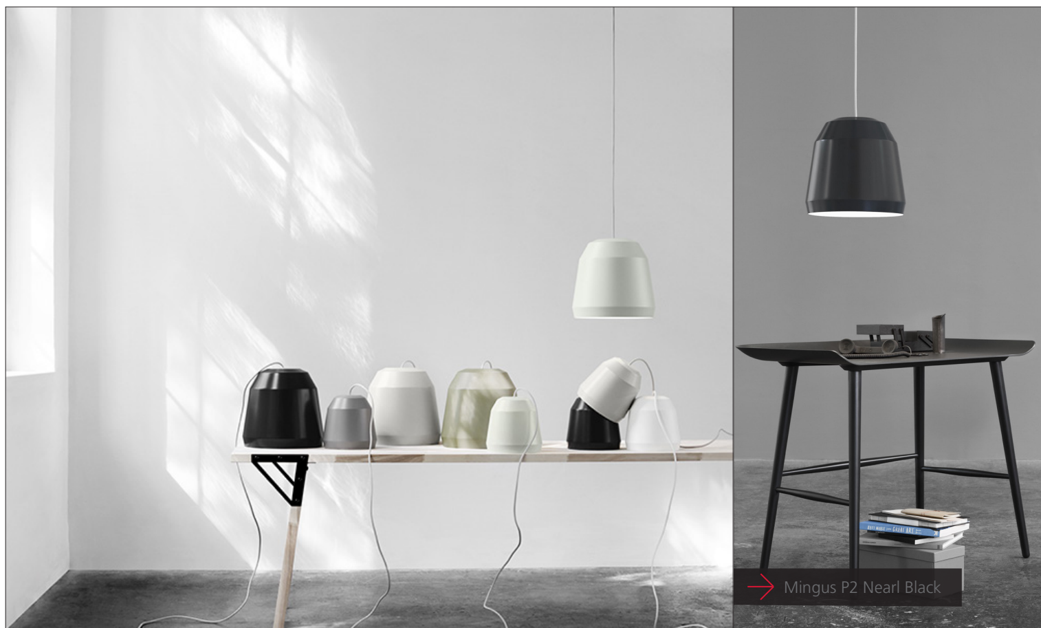
→ Mingus P2 Near Black