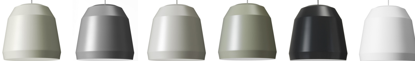
→ Light Celadon, Very Grey, Dusty Limestone, Pale Moss, Nearly Black and White