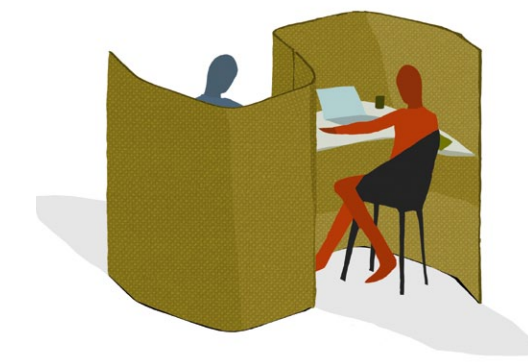
Two Workbays Retreat M, staggered.

Workbays are suitable for a wide range of different rooms. The system can be extended and adjusted as necessary and thus grows organically. The concept is based on wall elements in two different heights.