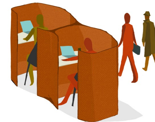
Two Workbays Retreat L, in a row.