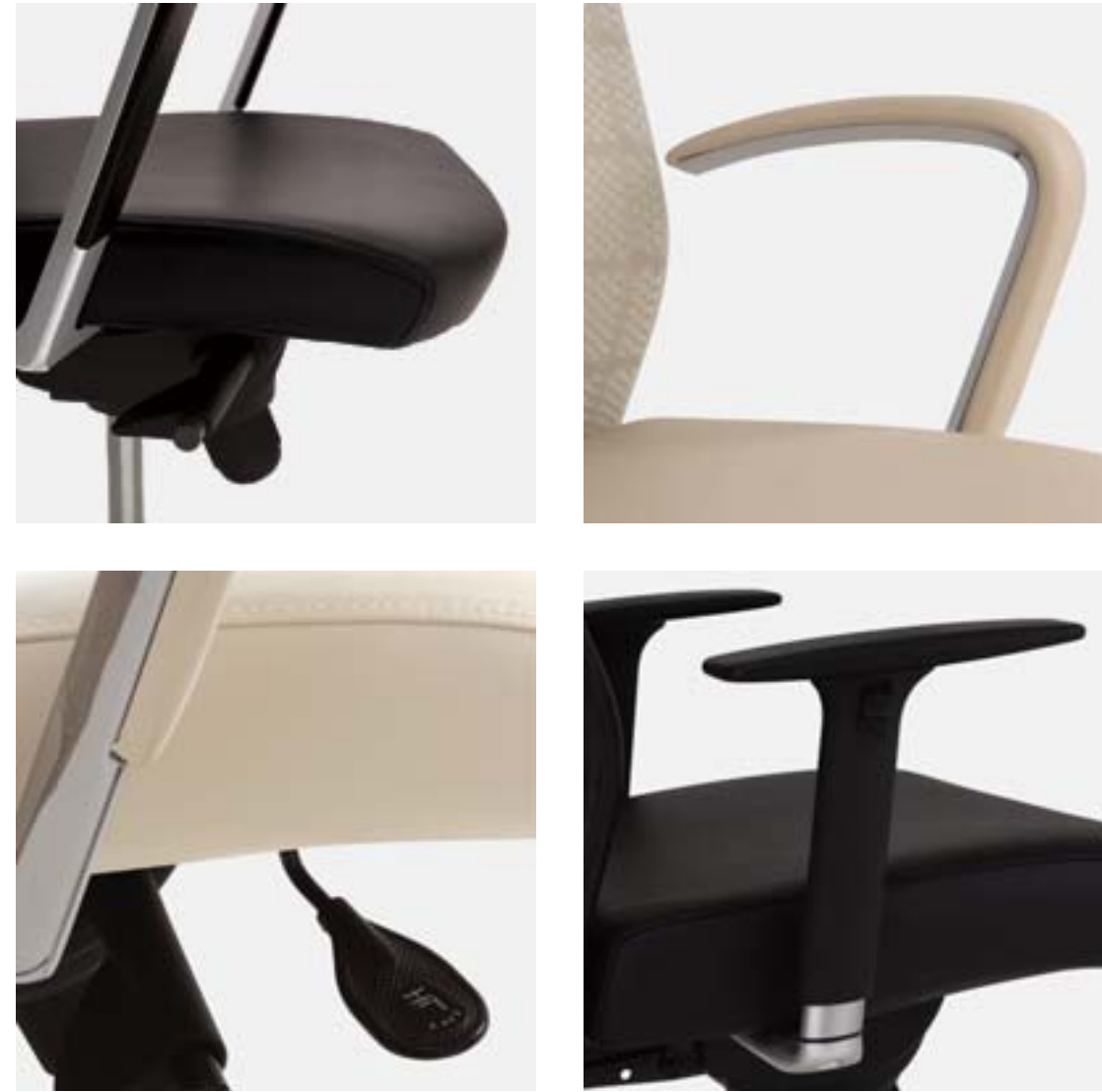
TOP LEFT: The Synchro Tilt mechanism, which provides a single lever controlling a range of tilt lock locations, an anti-kick-back release, and gas lift height adjustment; TOP RIGHT: Leather wrapped fixed arm available with Silver Metallic finish. (Available in S Line only); BOTTOM LEFT: Seat slider mechanism; BOTTOM RIGHT: Optional textured plastic adjustable arm.