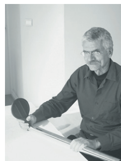
Design 2001. Burkhard Vogtherr & Tatzu Nosaki

«In case of a highly versatile table program, the mobility of the individual piece is of prime importance.»