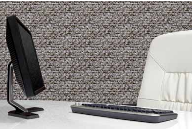
Note: images shown full scale