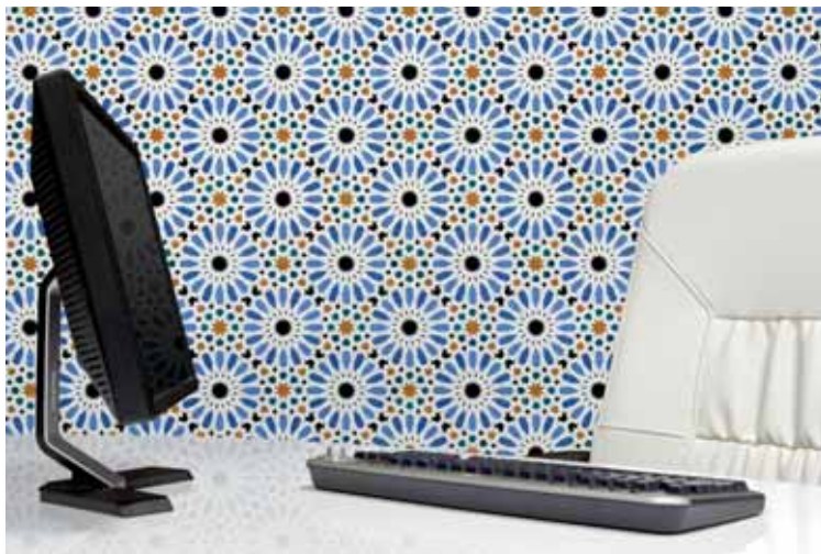
Note: images shown full scale