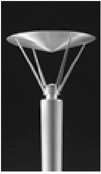
AMALFI Pole Mounted Luminaire

Indirect reflector luminaire with inverted tapered pole makes AMALFI's clean angular lines suitable for many architectural applications. Luminaire is precision-machined from billet aluminum, then satin anodized. Domed lens is temperature-resistant borosilicate glass. The conical shade is spun aluminum with anodized finish and supported by precision-formed aluminum struts. Inverted