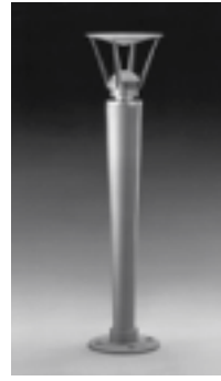
AMALFI Illuminating Bollard

Indirect reflector bollard is uniquely scaled to complement a wide variety of architectural styles. AMALFI housing is precision-machined from billet aluminum, then satin anodized. Domed lens is temperature-resistant borosilicate glass. The conical shade is spun aluminum with anodized finish and supported by precision-formed aluminum struts. Cast aluminum shaft is finished in finely textured paint. Bollard is