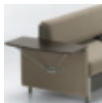
Side table allows seamless integration of horizontal surface