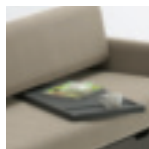
Deck tray converts cushion area into functional surface