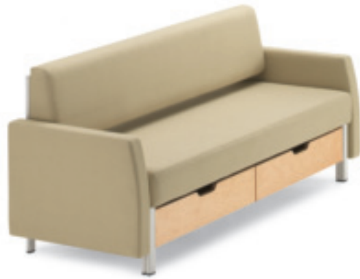
Single Size, Arcked Arm RVS31/80 W 80 H 33 D 28