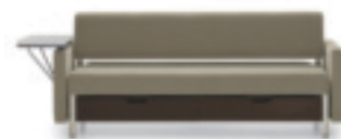
Twin Size, Thick Arms Opt Side Table RVS35/80-ST-L W 92 H 35 D 34/46