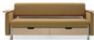
Twin Size, Thick Arms Opt Tablet Arm Caps RVS35/80-TA W 87 H 33 D 34/46