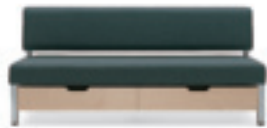
Single Size, Armless RVS10/72 W 72 H 33 D 28/34