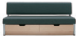
Single Size, Armless Opt Floor Panel RVS10/72-IF W 72 H 33 D 28/34