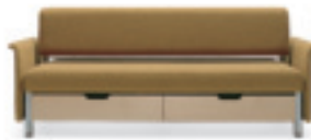
Twin Size, Thin Arms RVS25/80 W 80 H 33 D 34/46