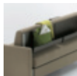
Rear storage provides dedicated space for personal items (twin only)