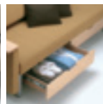
Integrated drawers provide storage for guests and facility