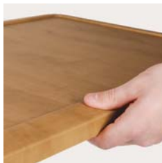
Top rises with slight upward pressure