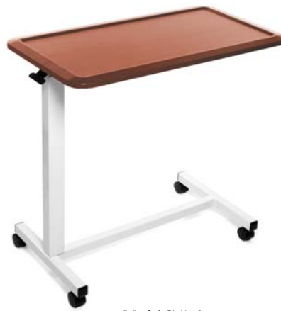
Model ST140 Top size 16" x 30" 50 lb weight capacity

Column and base are constructed with 14 gauge steel available in 3 finish choices: black or almond powdercoat; or chrome plated.