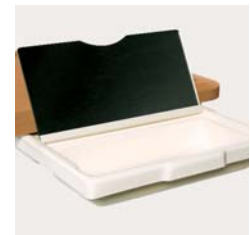
Optional vanity tray with mirror