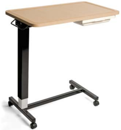
Model ST160 shown with optional powdercoated base and vanity tray Top size 18" x 32" 100 lb weight capacity