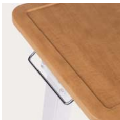
Easy-access gas spring lever for height adjustment