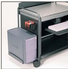
Computer Cart Front Detail

Food service carts accommodate sliding storage for Camtrays.