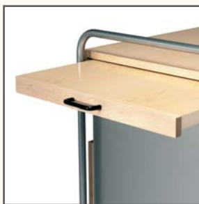
Pull-Out Surface Detail