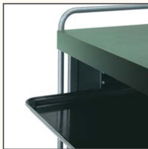
Food Tray Detail

Universal carts include a vented back panel to allow access and ventilation for electronic equipment.