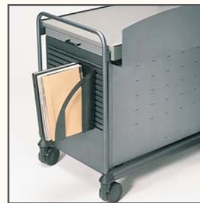
Computer Cart Back Detail

Optional pull-out CPU tower tray; adjustable keyboard & mouse surface; Slatwall™ for organizational tools.