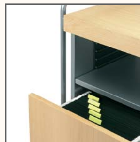
File Drawer Detail

All carts include an additional surface area that extends 15 1/2".