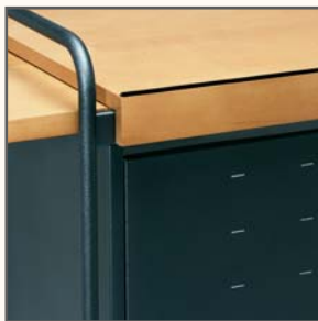
Vented Back Panel

File carts include a locking lateral file drawer that accommodates both letter and legal hanging files.