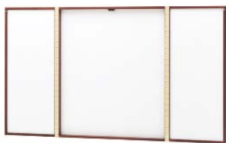
✓ Presentation board