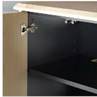
Doors have 90°, three-way adjustable, European-style hinges.