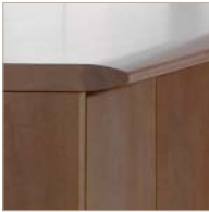
Solid wood edge profiles available on credenza front sides only