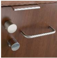
Optional pulls, knobs, or handles in nickel or polished chrome