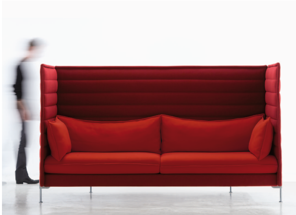
The fact that the Alcove Highback Sofas offer protection from both acoustic and visual stimuli makes them a welcome addition to any open-plan office environment. They are perfect to retreat to and for holding meetings.

The brothers Ronan and Erwan Bouroullec live and work in Paris. Their field of work spans from small articles of daily use through to architecture projects. They have worked with Vitra since 2000 and have contributed numerous designs to both the office and home collections.