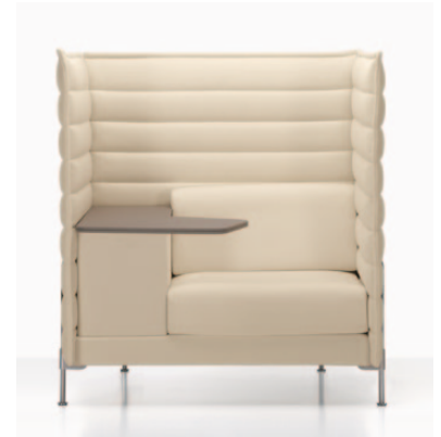
Alcove Highback Work