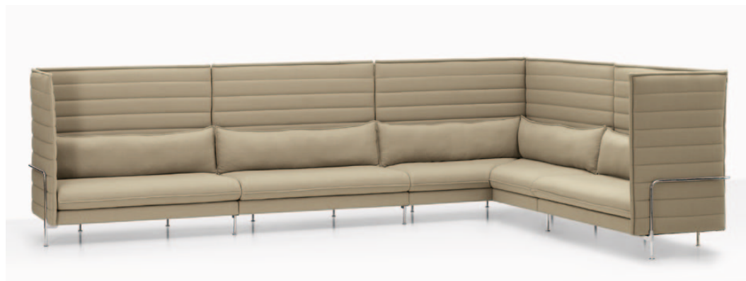
The Alcove Highback System allows for both shape and size configurations that meet the demands of any given space.