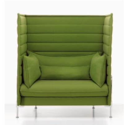
Alcove Highback Love Seat