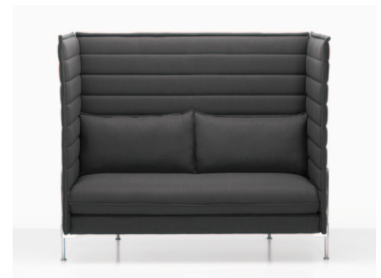
Alcove Highback Two-Seater