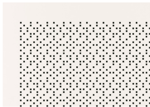
The perforated doors absorb sound and disturbing noises.

The Storage Locker facilitates non-territorial working: Employees who do not have individually assigned desks can come into the office and take their work materials out of these lockers. They can store their personal belongings in them and lock everything up securely using their own personal PIN code. This way they do not have to carry as much around with them and the desks stay tidy whenever they are not in use.