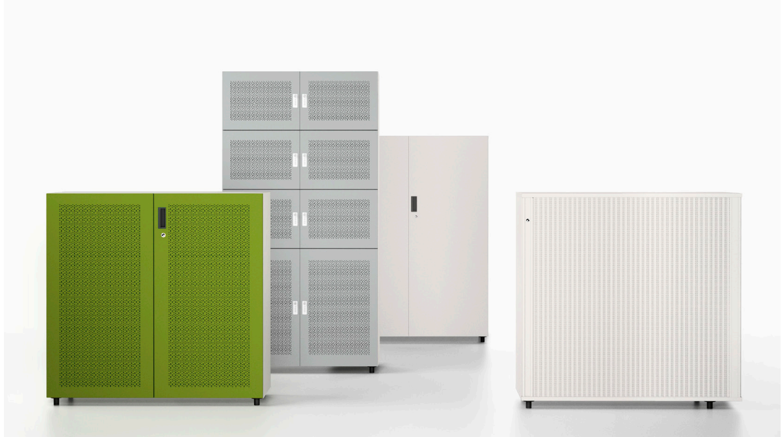
With its range of sizes, materials and colours, Storage offers flexible solutions for all kinds of spaces, meeting the needs of companies and employees.

The Storage cupboard programme by Arik Levy, which is compatible with all of Vitra's office furniture systems, has a simple and logical construction. The cabinets and sideboards come in different widths and heights, can be combined and supplemented, and offer different kinds of storage spaces that are easy to configure, assemble, modify and disassemble. One critique of open space offices is often that they lack noise insulation. With this in mind, Vitra developed highly effective acoustic fronts, which have been proven to decrease noise levels in office spaces and therefore facilitate concentrated work.