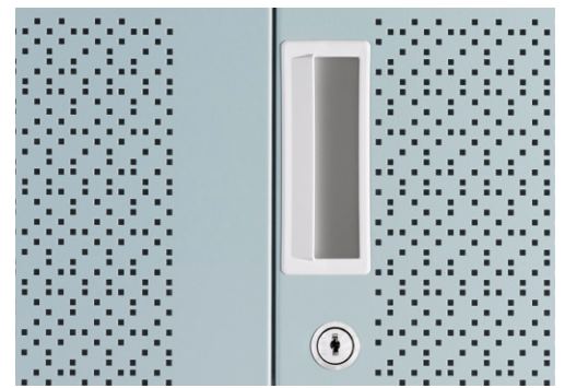
The ergonomic and attractive handles are available in the colours soft light and dimgrey.