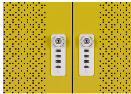
Employees can collect their work materials which they store in the lockers.