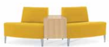
OUTWARD FACING CHAIRS WITH LOW GANGED TABLES