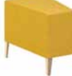
OUTWARD FACING ARMREST