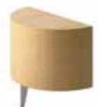
HALF ROUND TABLE (END OF RUN)