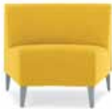
INWARD FACING CHAIR