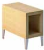
STRAIGHT TABLE (FREESTANDING, END OF RUN, OR GANGED)