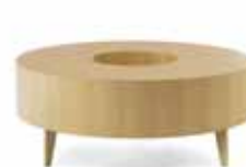
ROUND TABLE (FREESTANDING)