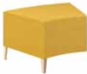
INWARD FACING ARMREST