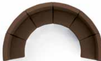
E SITTING TOGETHER