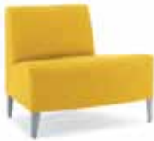
OUTWARD FACING CHAIR

Modular lounge seating with standard wood legs in walnut or maple. Coordinating modular tables with storage, benches, and freestanding round tables. Legs optionally available in the following paint colors: black gloss, graphite gloss, arctic white gloss, midnight brown gloss, platinum gloss, and metal.