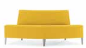
OUTWARD FACING LOVESEAT