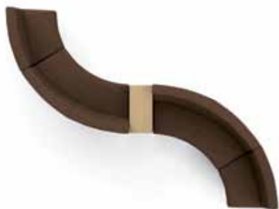
B SITTING APART