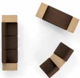
D LOUNGING ARTFULLY