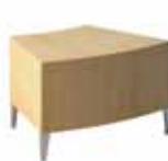
HIGH FREESTANDING TABLE