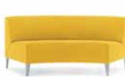
INWARD FACING LOVESEAT