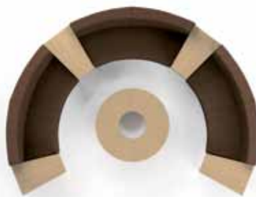
C MEETING OVER COFFEE