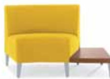
INWARD FACING CHAIR WITH LOW END OF RUN TABLE