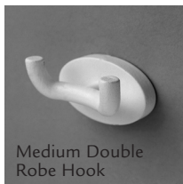
Medium Double Robe Hook