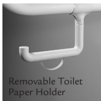
Removable Toilet Paper Holder