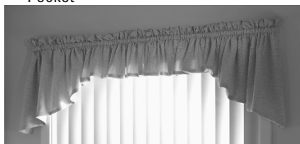
Tapered Rod Pocket