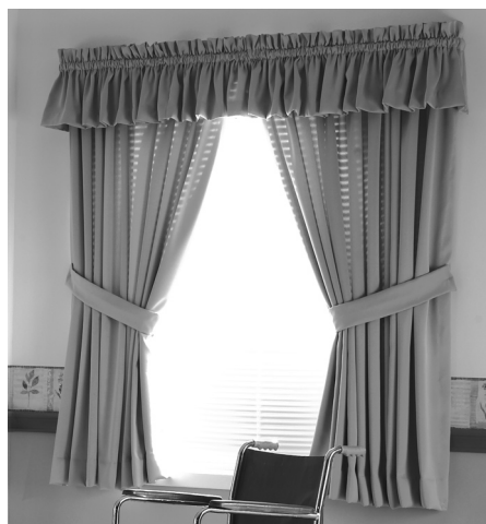
Rod Pocket with Tie Backs (Purchase valance shown separately)