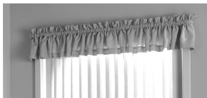
▶ Straight Hem Rod Pocket