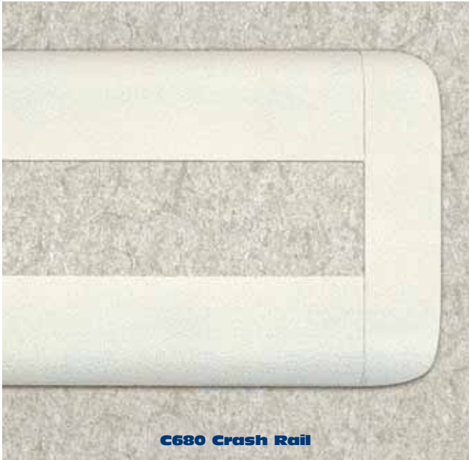
C680 Crash Rail

KOROGARD C610 and C680 Crash Rails are 6" (152.4mm) rails with full-length vinyl bumpers and continuous aluminum retainers. A 2" (50.8mm) accent strip is added to the profile extrusion to add contrast and design options. The accent strip in the C610 Crash Rail is a solid color, while the C680 Crash Rail has a strip of KOROSEAL ® or VICRTEX ® Flexible Wallcovering. The C610 Crash Rail is ideal for medium- to high-impact areas, and the C680 Crash Rail is best suited for low-impact areas. End and corner caps are available either as patented foam cushion or as rigid plastic.