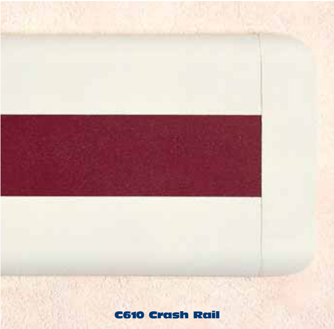
C610 Crash Rail