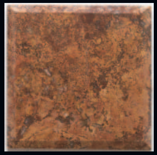
8'' x 8'' with \frac{1}{2}'' Bevel