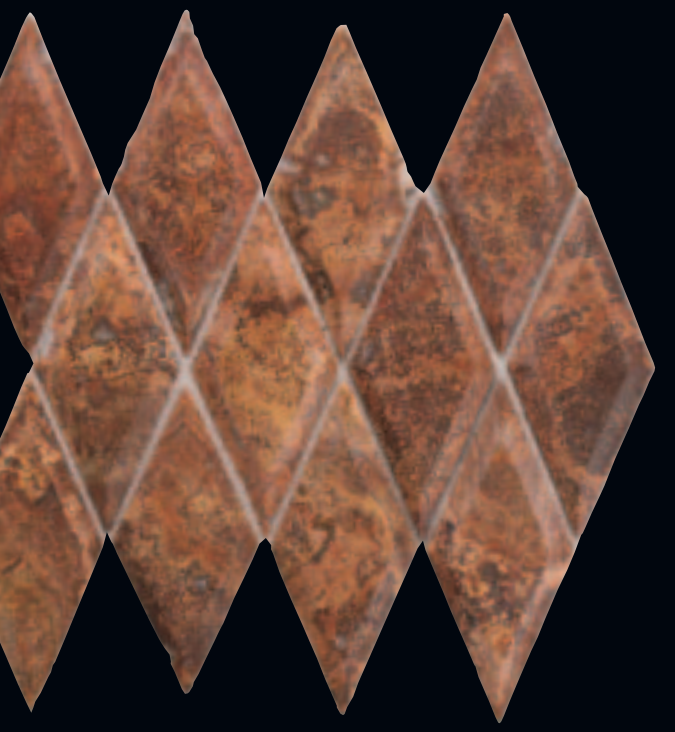
3" x 6" Harlequin with ½" Bevel (1 Sq. Ft. Coverage)