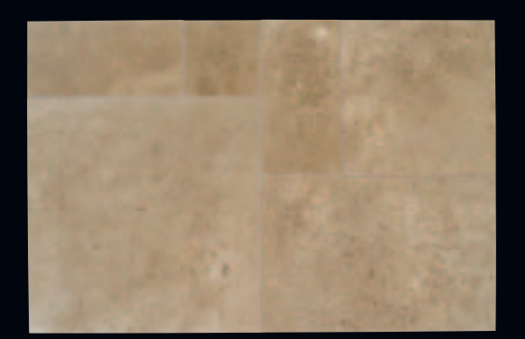
Arroya Bluff MST2* 8" x 8", 8" x 16", 16" x 16", 16" x 24" and 24" x 24" Unfilled/Honed