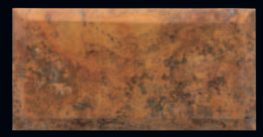
4" x 8" with 1/2" Bevel