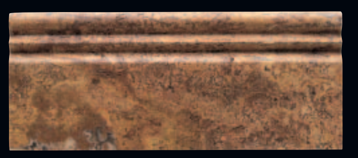
5" x 12" Base Moulding