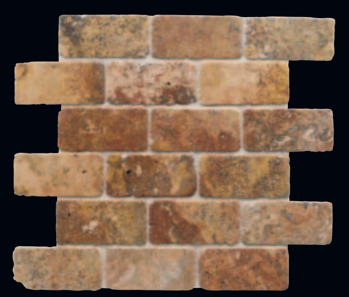
2" x 4" Tumbled Brick Joint (1 Sq. Ft. Coverage)