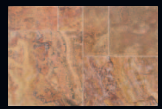
Colima Sunset MST4 8" x 8", 8" x 16", 16" x 16", 16" x 24" and 24" x 24" Filled/Honed