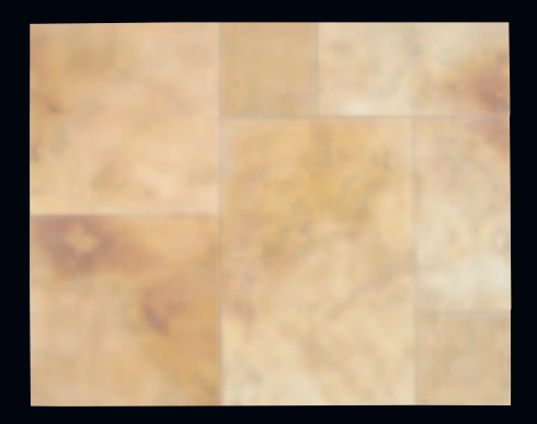
Yucatan Sunrise MST3 8" x 8", 8" x 16", 16" x 16" and 16" x 24" Filled/Honed