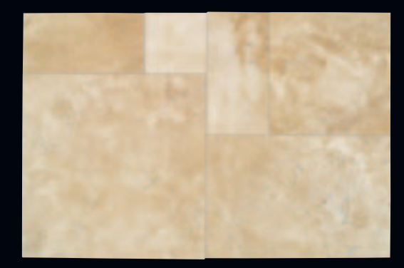
Playa Blanca MST1 8" x 8", 8" x 16", 16" x 16", 16" x 24" and 24" x 24" Filled/Honed