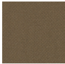
1204 Rubber Band