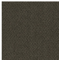
1210 Duct Tape