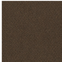
1207 Gorilla Glue