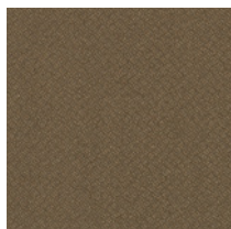
1204 Rubber Band