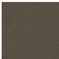
1208 Staple Gun