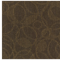
386 Feats of Strength