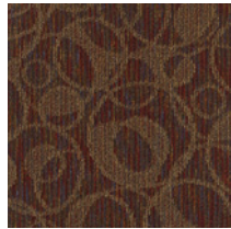
392 Fire Breather