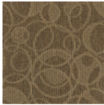
384 Stilt Walker