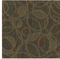
389 Snake Charmer