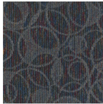
391 Human Cannonball