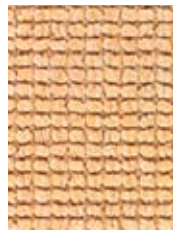
46627 Flax 14-0826 TPX