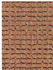
89188 Tobacco 18-1022 TPX