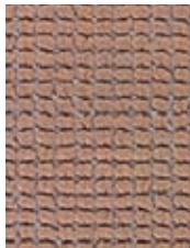
89187 Hemp 17-1118 TPX