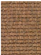
46370 Mesquite 18-0820 TPX