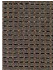
89189 Woodland Green 18-0312 TPX