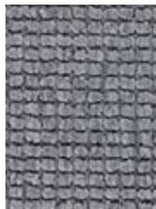
46625 Agave 17-0207 TPX