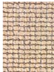
46628 Balsa 13-0513 TPX