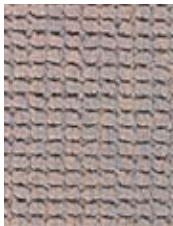
87736 Smoke 16-0207 TPX