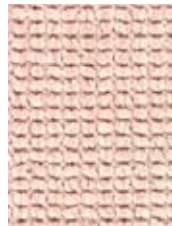
93957 Crème 13-0607 TPX