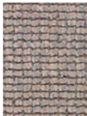
46371 Savanna 17-0610 TPX