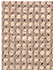
844 Jasper 17-1009 TPX, 14-1108 TPX