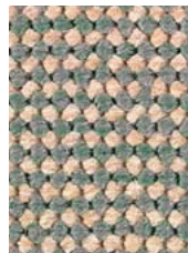
428 Peridot 17-0610 TPX, 13-1006 TPX