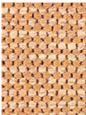
342 Citrine 16-1324 TPX, 13-1009 TPX