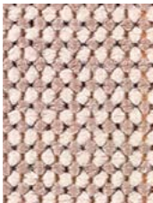
831 Smoky Quartz 16-1210 TPX, 13-0908 TPX