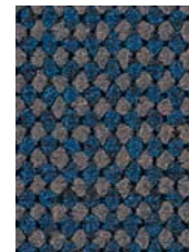
569 Sapphire 19-4118 TPX, 18-0403 TPX