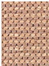
368 Topaz 16-1212 TPX, 14-1110 TPX