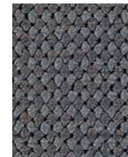
789 Moonstone 18-0403 TPX, 18-0601 TPX