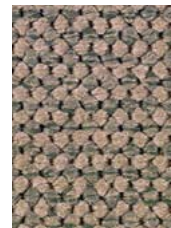
488 Olivine 18-0312 TPX, 17-1009 TPX