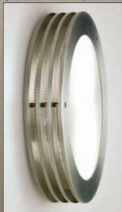
d8030-1FF24-120-AL (As ADA wall sconce)