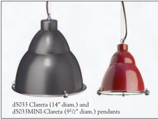
d5033 Clareta (14" diam.) and d5033MINI-Clareta (9 1/2" diam.) pendants