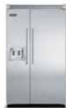
VCSB548D/VISB548D 48" Wide with Dispenser