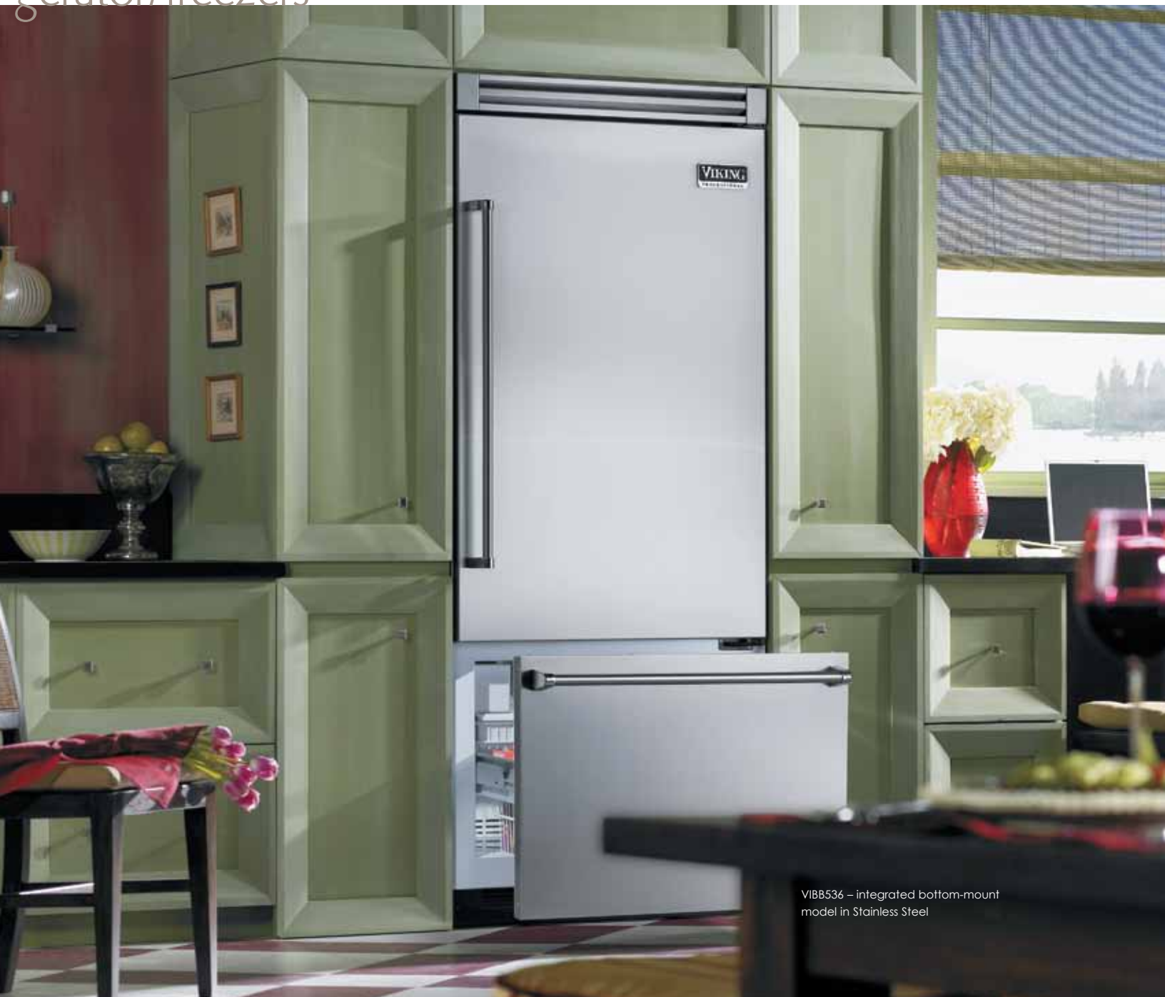
VIBB536 – integrated bottom-mount model in Stainless Steel

The Adjustable Cold Zone™ can be set up to five degrees colder than refrigerator temperature.