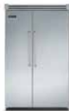
VCSB548/VISB548 48" Wide