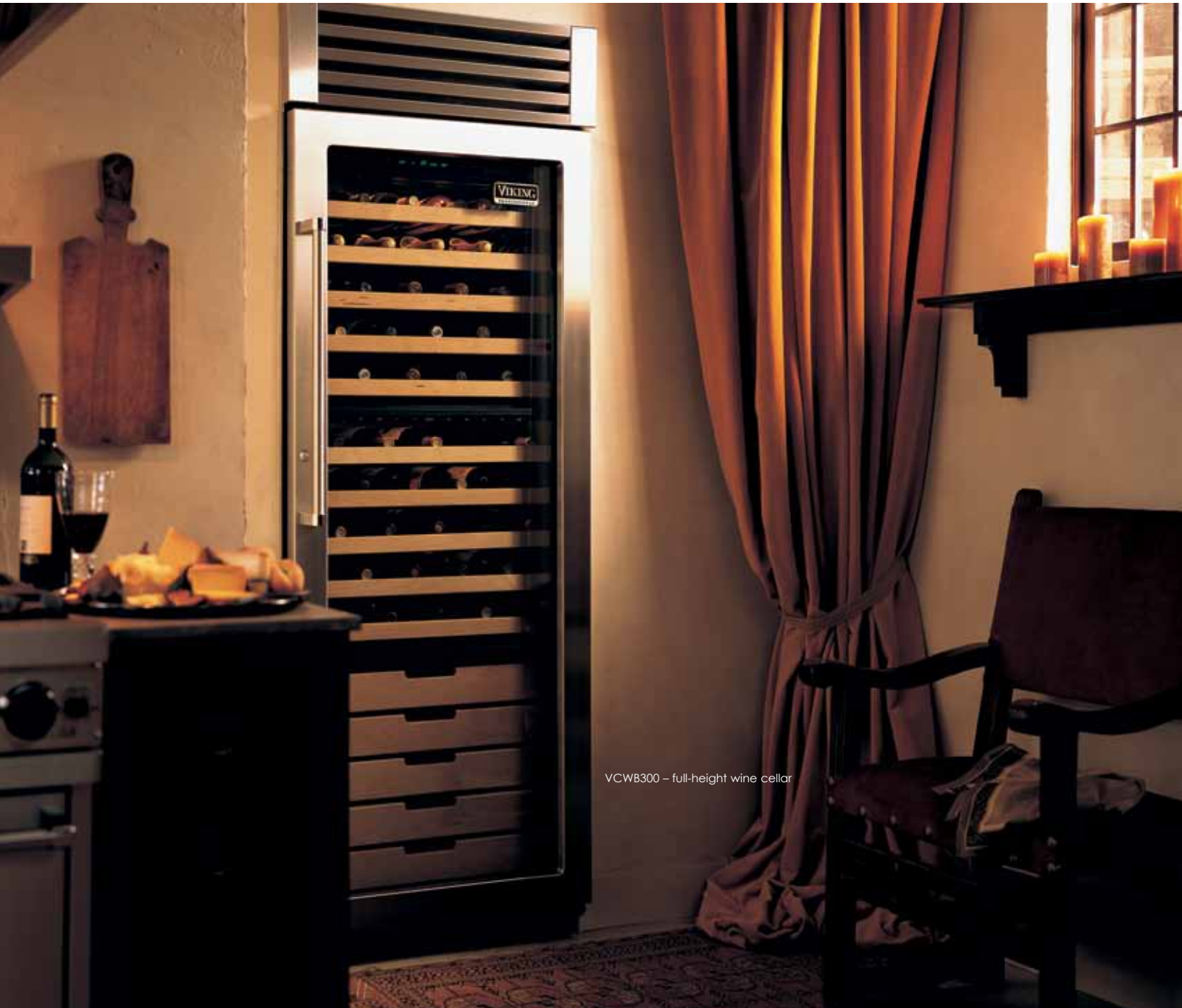
VCWB300 – full-height wine cellar