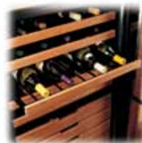
Coated shelves reduce vibration and hold bottles snugly in place.