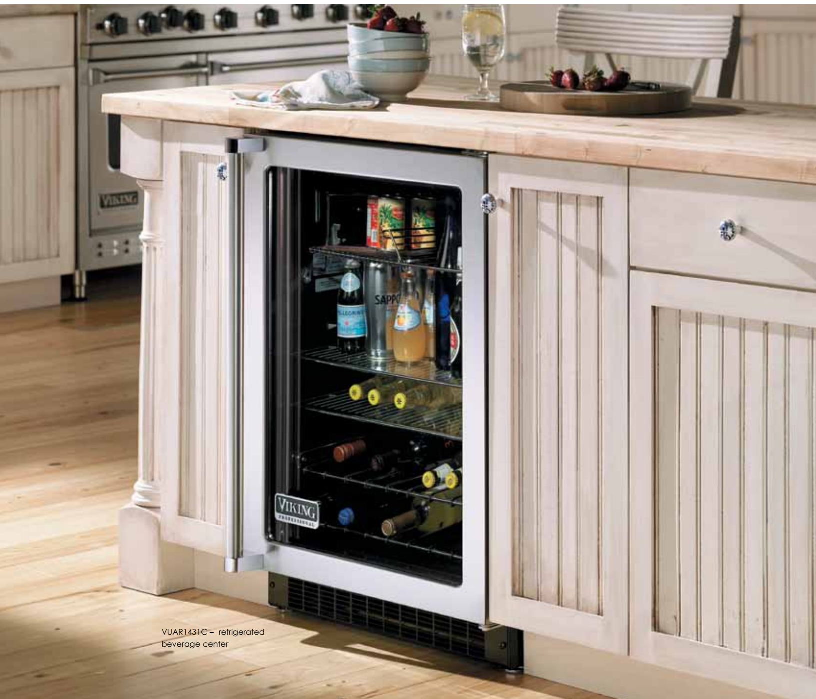
VUAR1431C – refrigerated beverage center