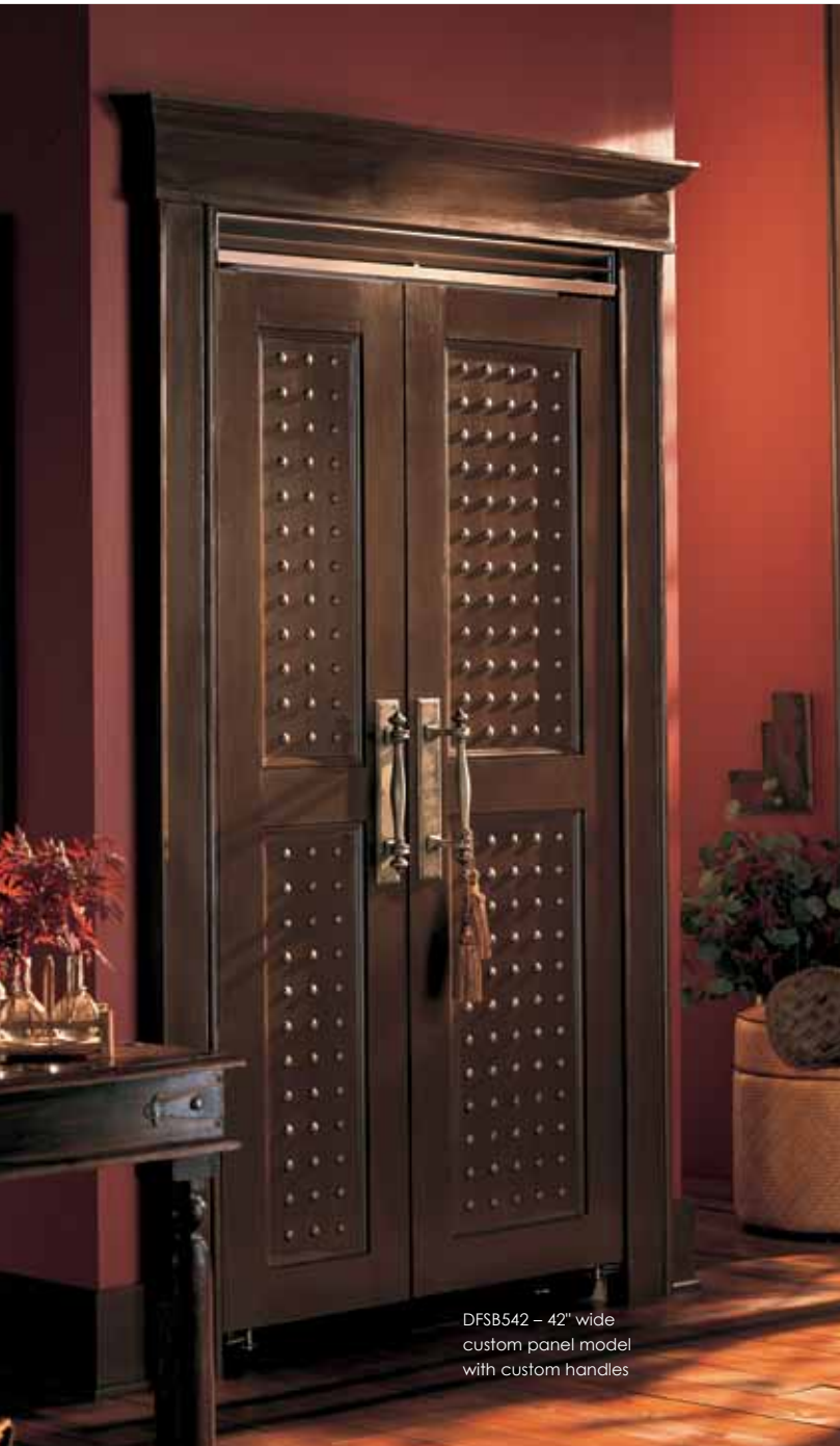
DFS542 – 42" wide custom panel model with custom handles