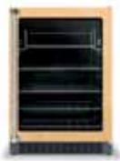
DFUR1441C Custom Panel Model Professional Handle Clear Glass