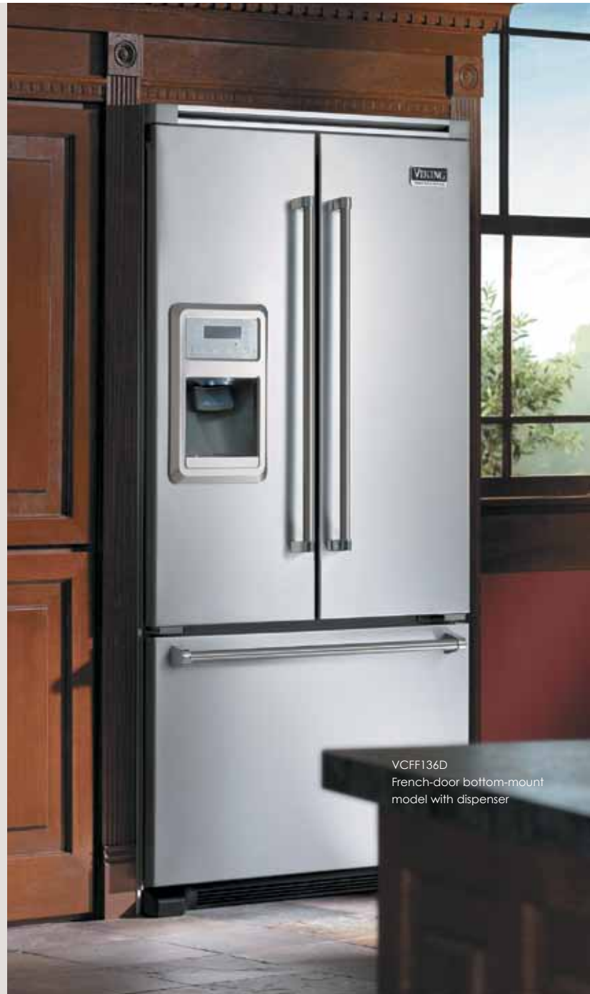
VCFF136D French-door bottom-mount model with dispenser

The French-door bottom-mount model offers grand access to cold storage and convenient waist-high freezer space.