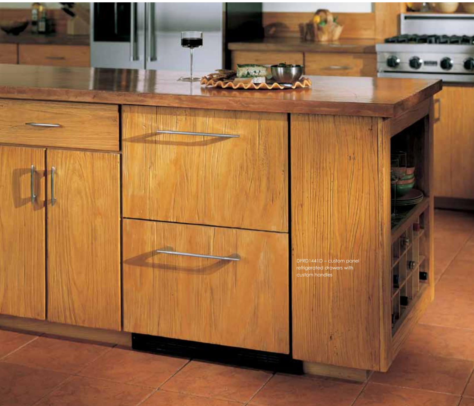
DFRD1441D – custom panel refrigerated drawers with custom handles