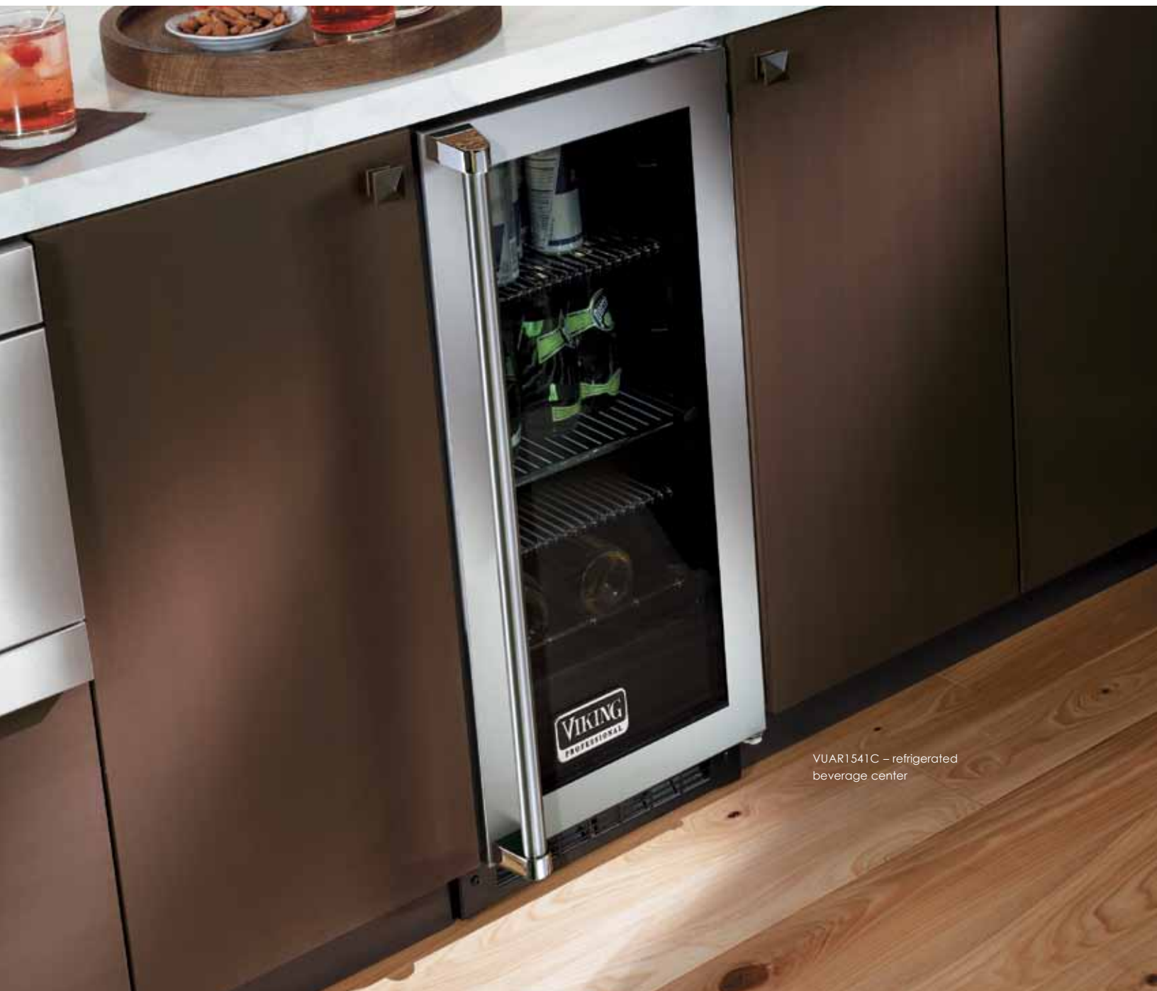
VUAR1541C – refrigerated beverage center