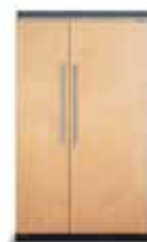
DFSB548 48" Wide Custom Panel Model Professional Handles