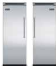
VCRB530/VIRB530 & VCFB530/VIFB530 30" Wide