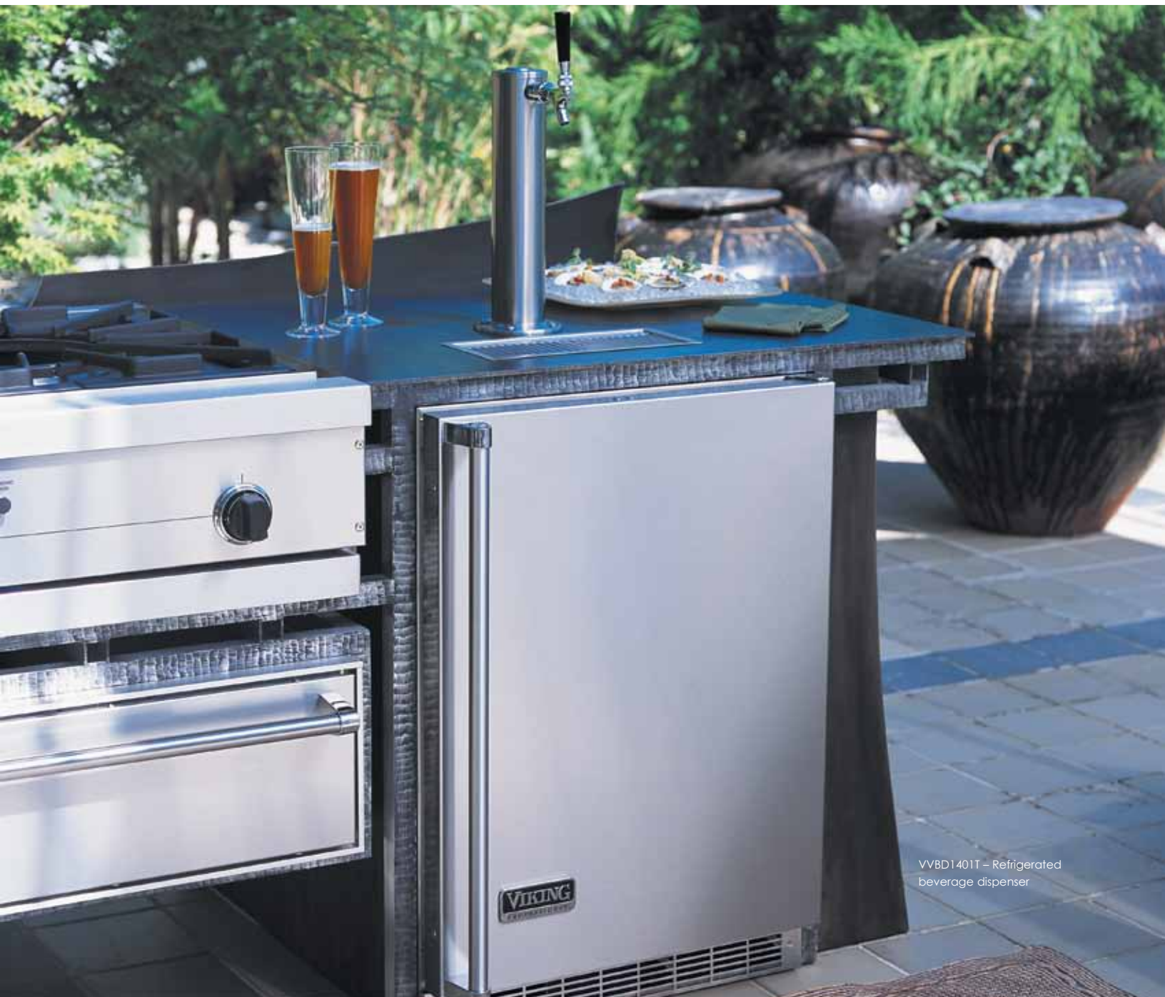
VVBD1401T – Refrigerated beverage dispenser