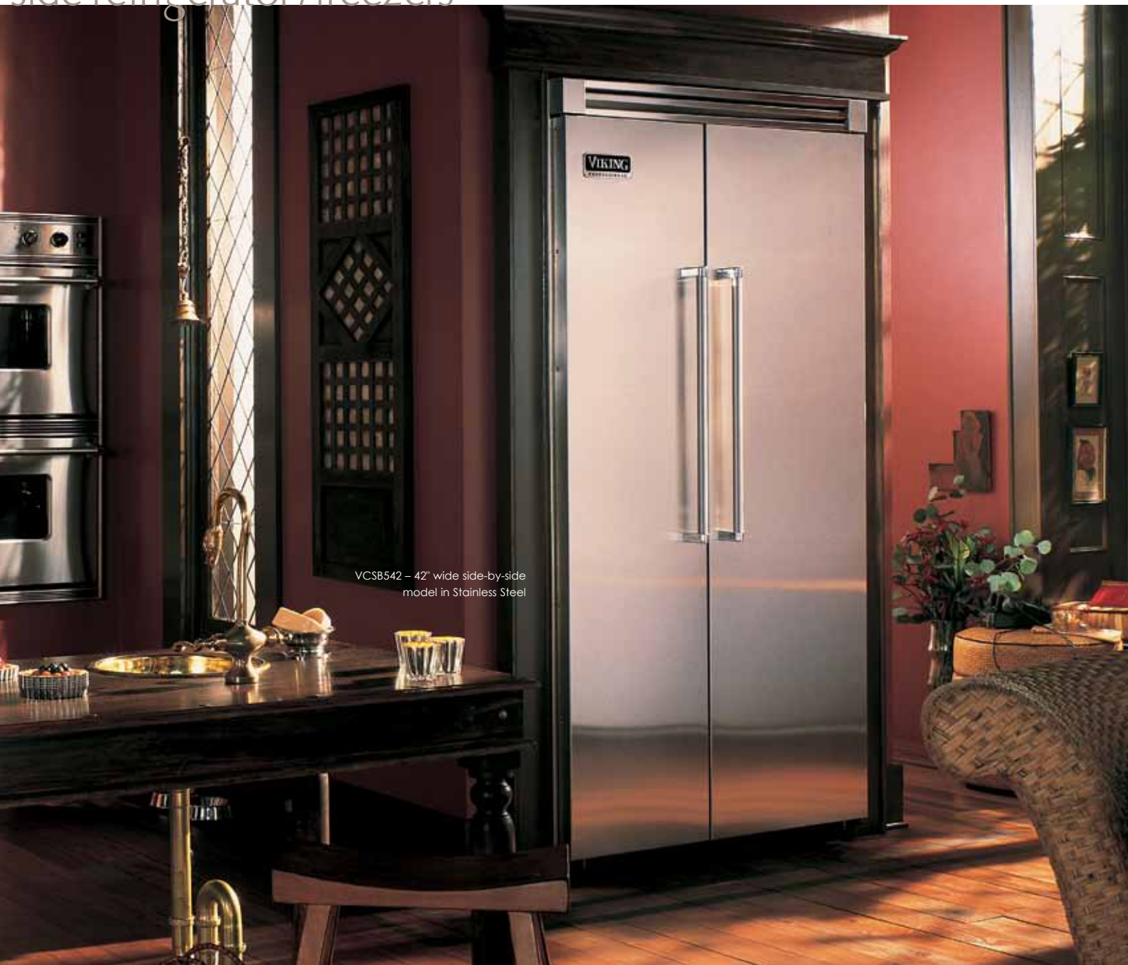
VCSB542 – 42" wide side-by-side model in Stainless Steel

The 48" wide side-by-side refrigerator/freezers have room for everything from pineapples to parfaits.