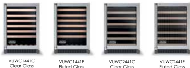
VUWC1441C Clear Glass