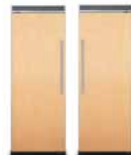
DFRB530 & DFFB530 30" Wide Custom Panel Models Professional Handles