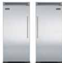
VCRB536/VIRB536 & VCFB536/VIFB536 36" Wide