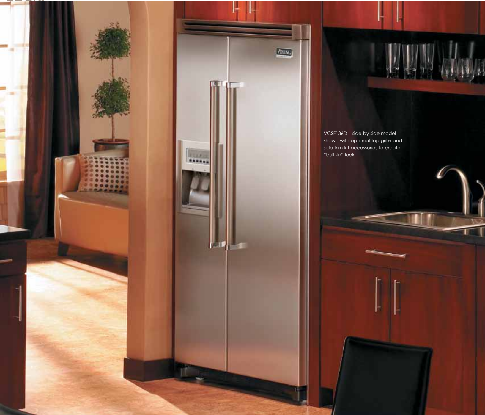
VCSF136D – side-by-side model shown with optional top grille and side trim kit accessories to create “built-in” look

Separate temperature controls for the door bin and Meat Savor™/Produce Drawer keeps everything perfectly chilled.