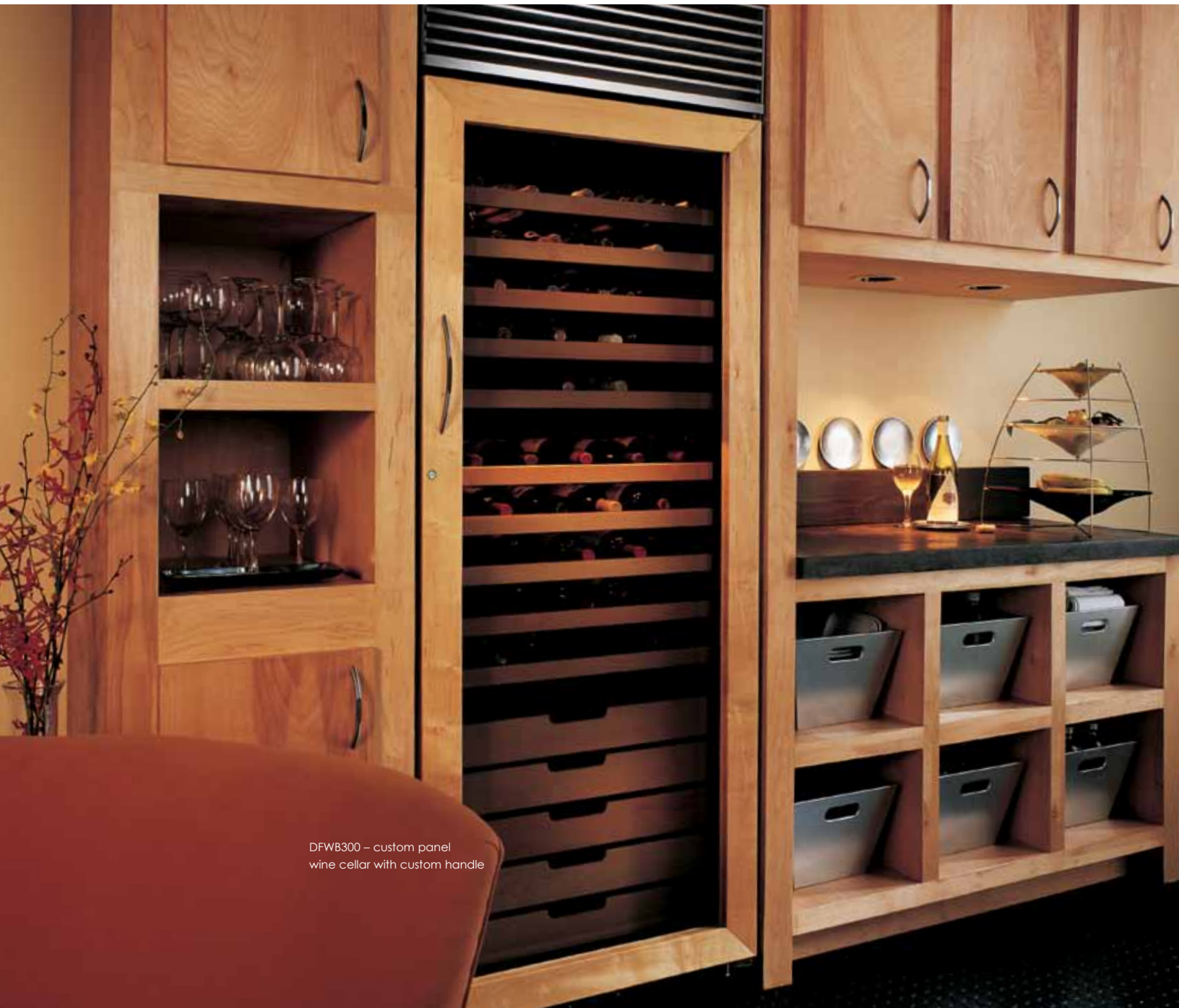
DFWB300 – custom panel wine cellar with custom handle