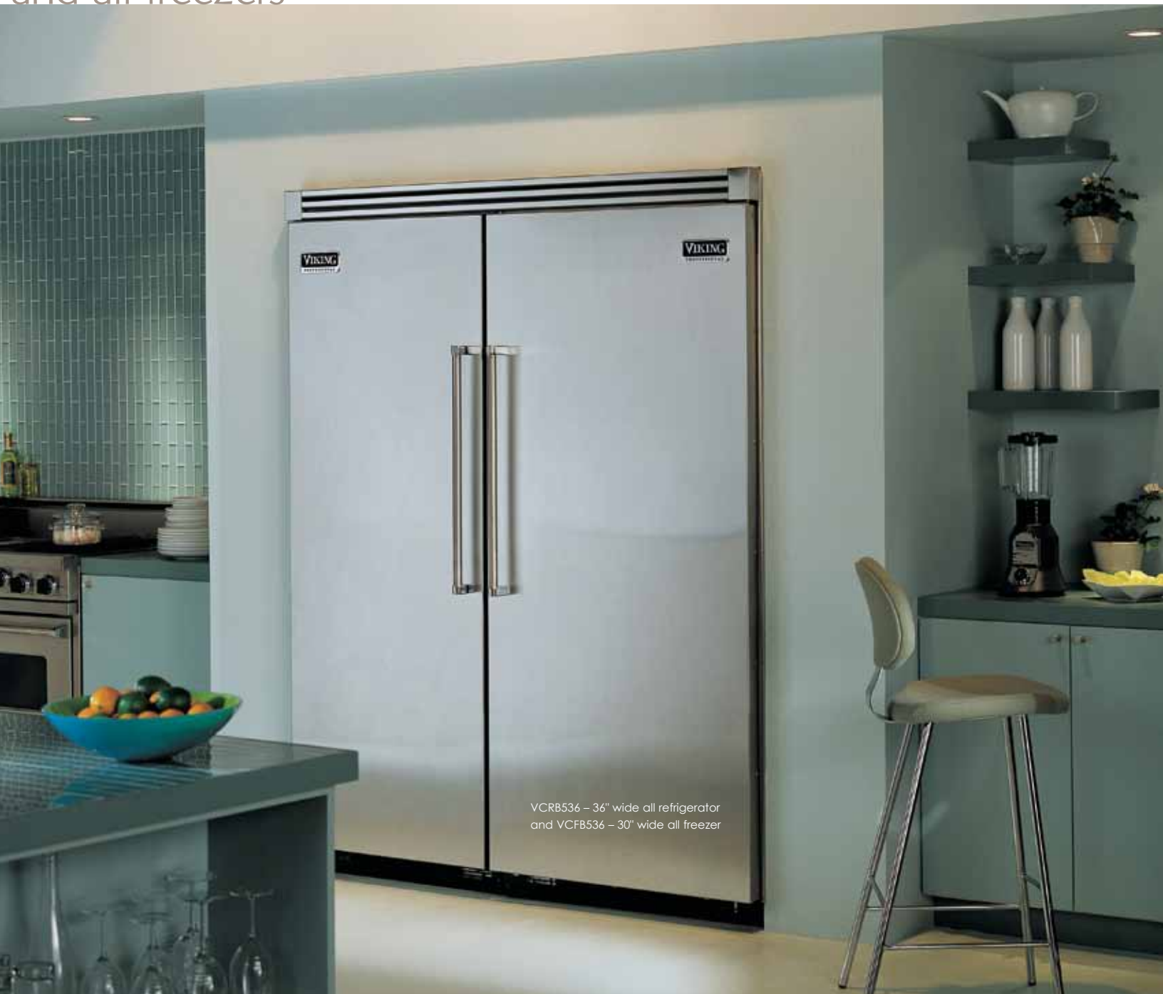
VCRB536 – 36" wide all refrigerator and VCFB536 – 30" wide all freezer