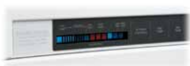
Electronic Temperature Control System maintains the desired temperature within 1 degree (48" wide model shown).