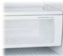
Large fruits and vegetables store easily in the two Humidity Zone™ Drawers (48" wide model shown).