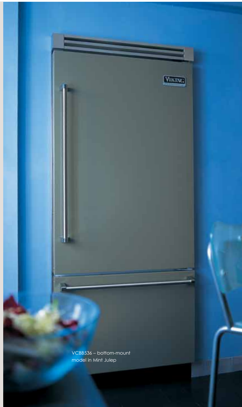
VCBB536 – bottom-mount model in Mint Julep