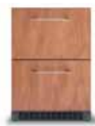
DFRD1441D Custom Panel Model