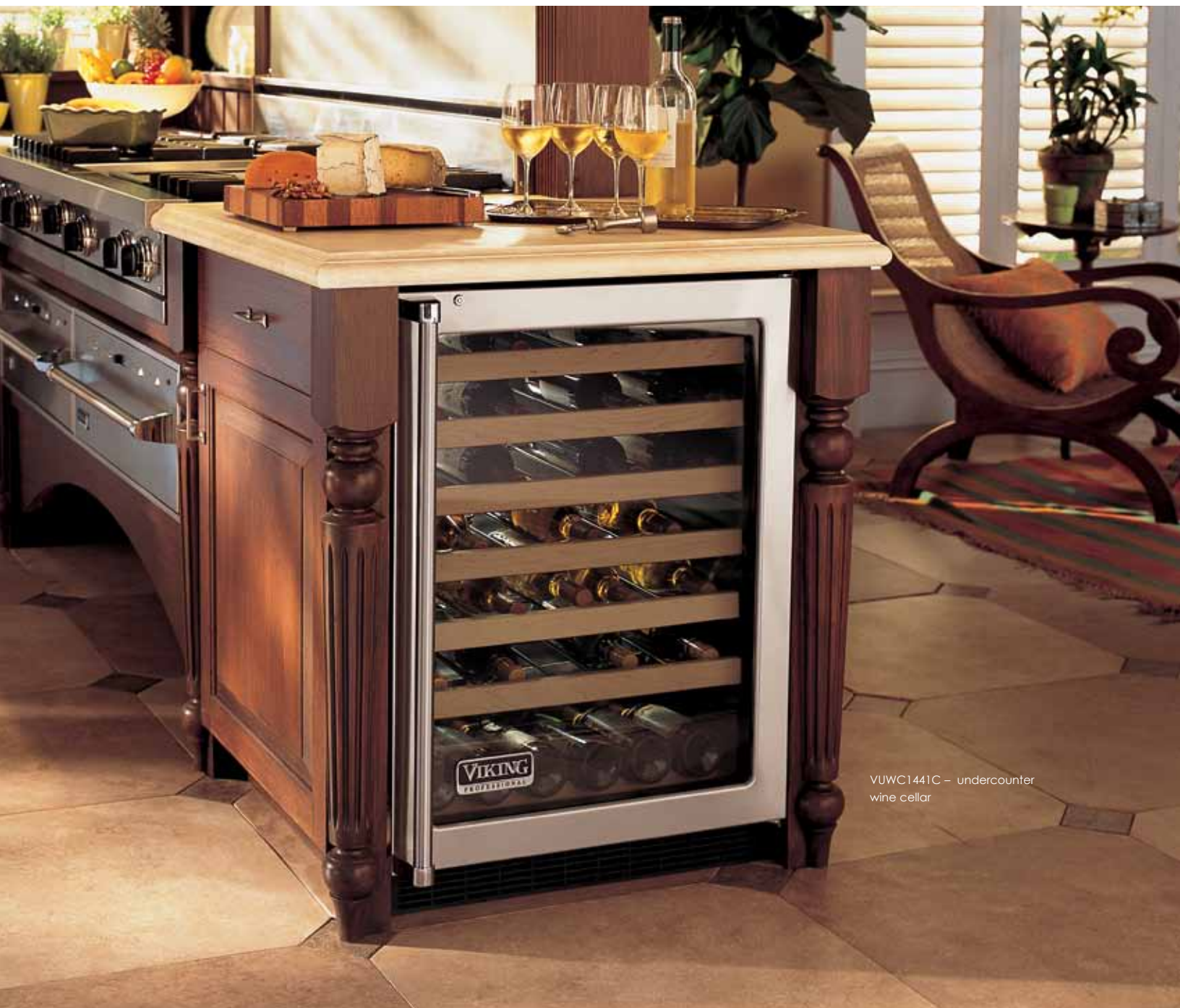
VUWC1441C – undercounter wine cellar