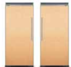
DFRB536 & DFFB536 30" Wide Custom Panel Models Professional Handles