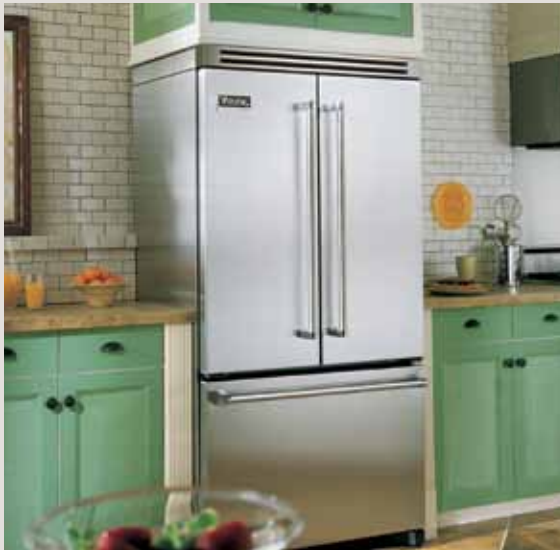
VCFF136 – Non-dispenser model shown with optional top grille and side panel accessories to create "wrapped" look