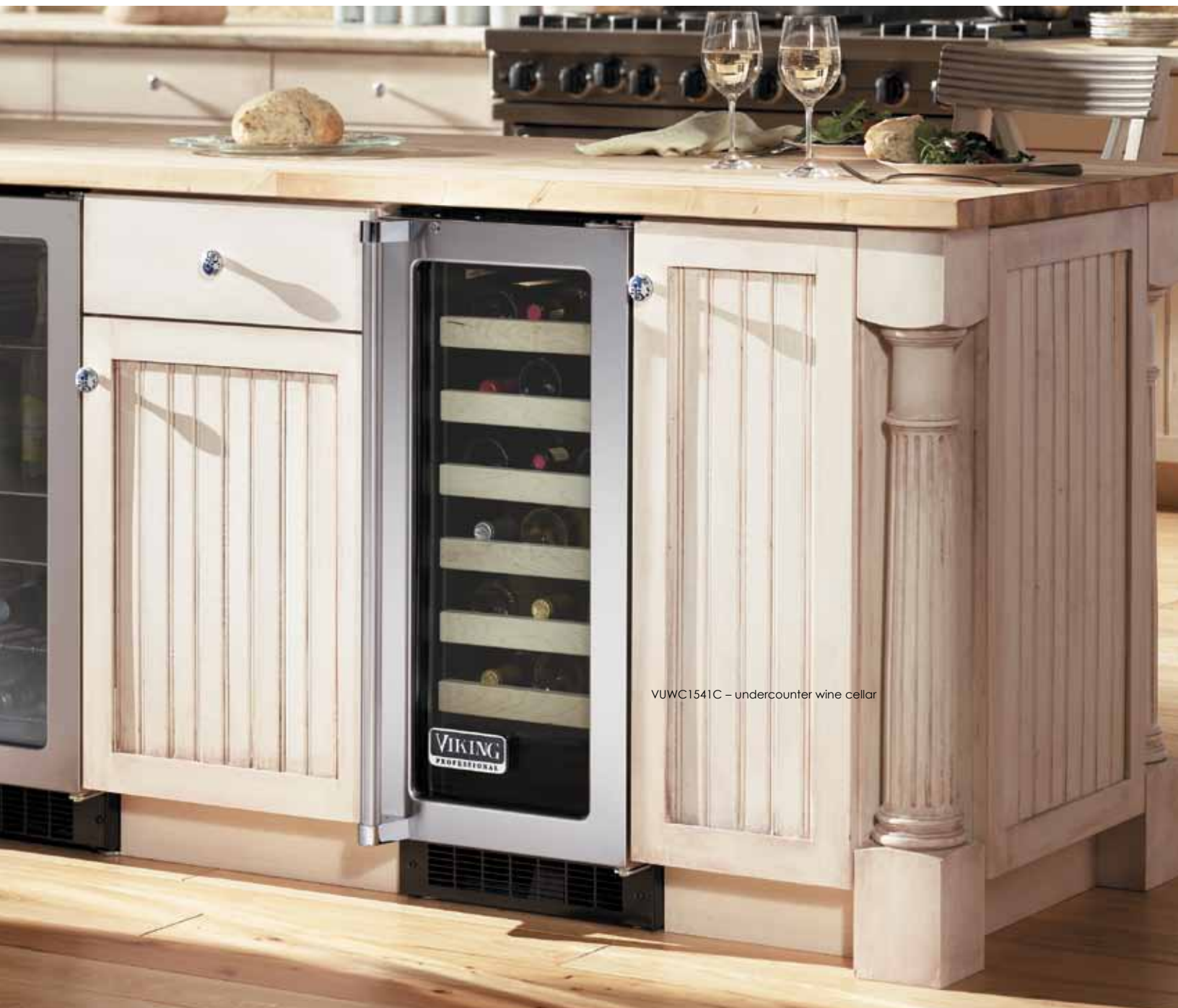
VUWC1541C – undercounter wine cellar