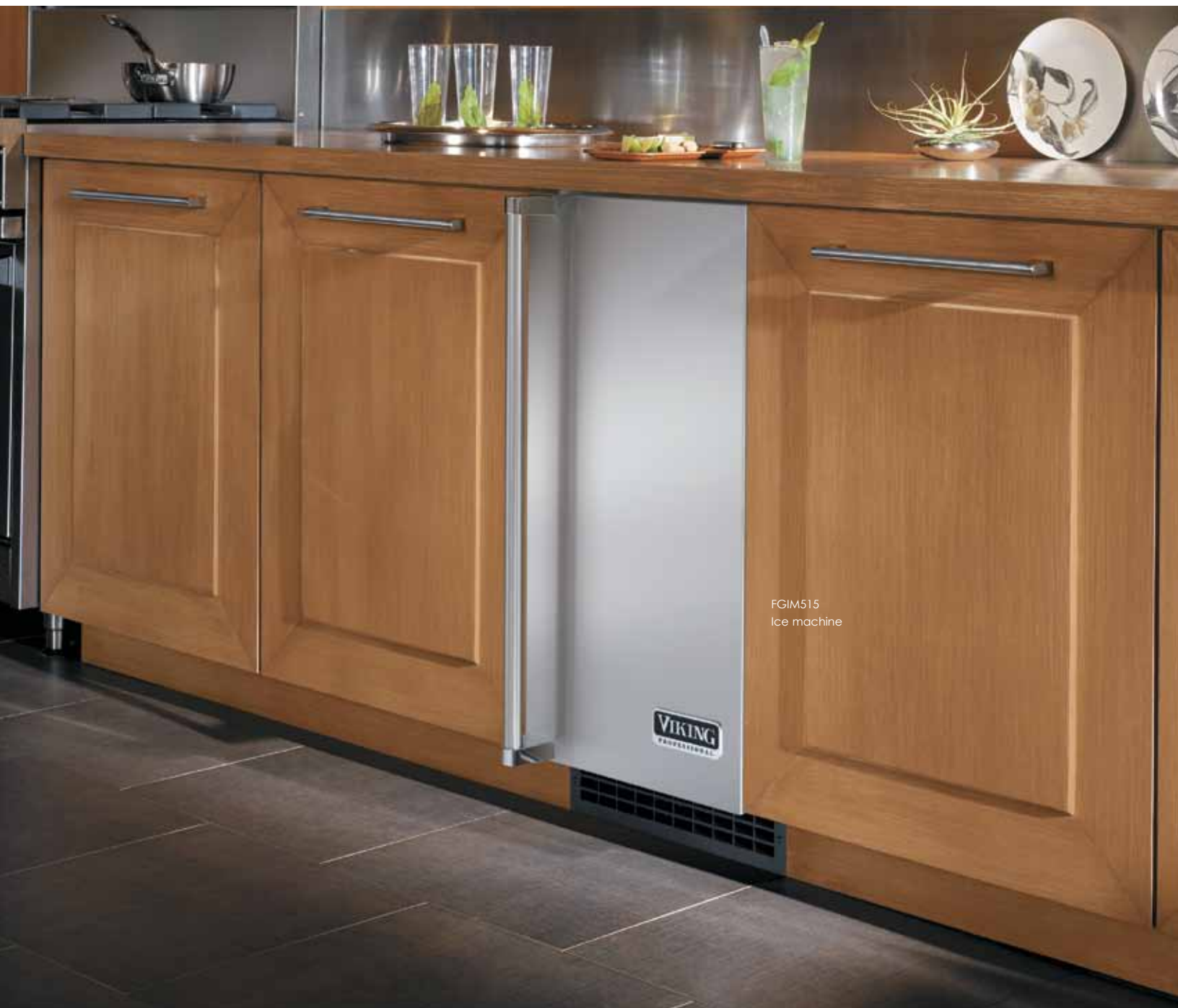
FGIM515 Ice machine