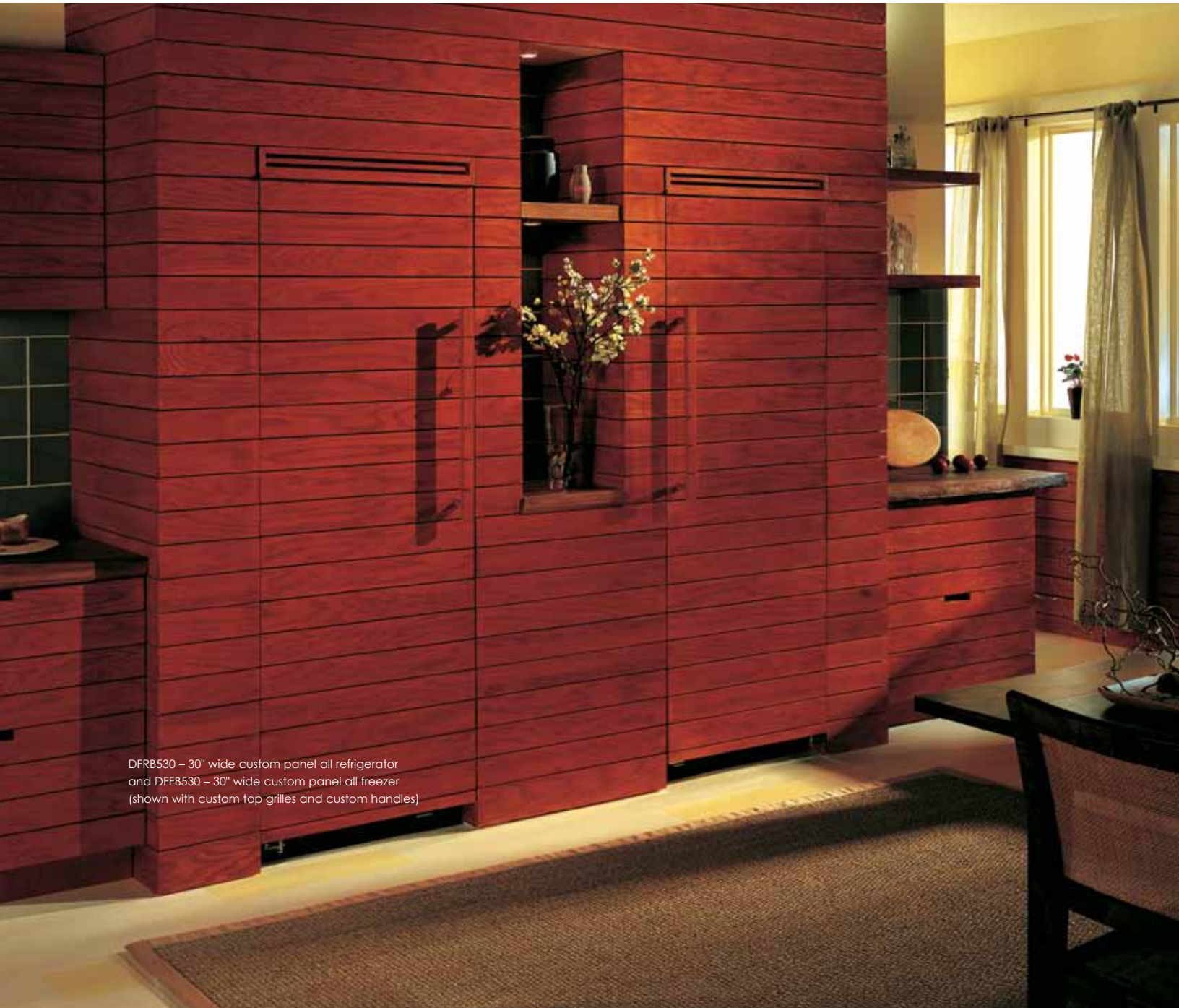
DFRB530 – 30" wide custom panel all refrigerator and DFFB530 – 30" wide custom panel all freezer (shown with custom top grilles and custom handles)