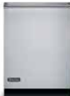
VDB325 Intelli-Wash Dishwasher