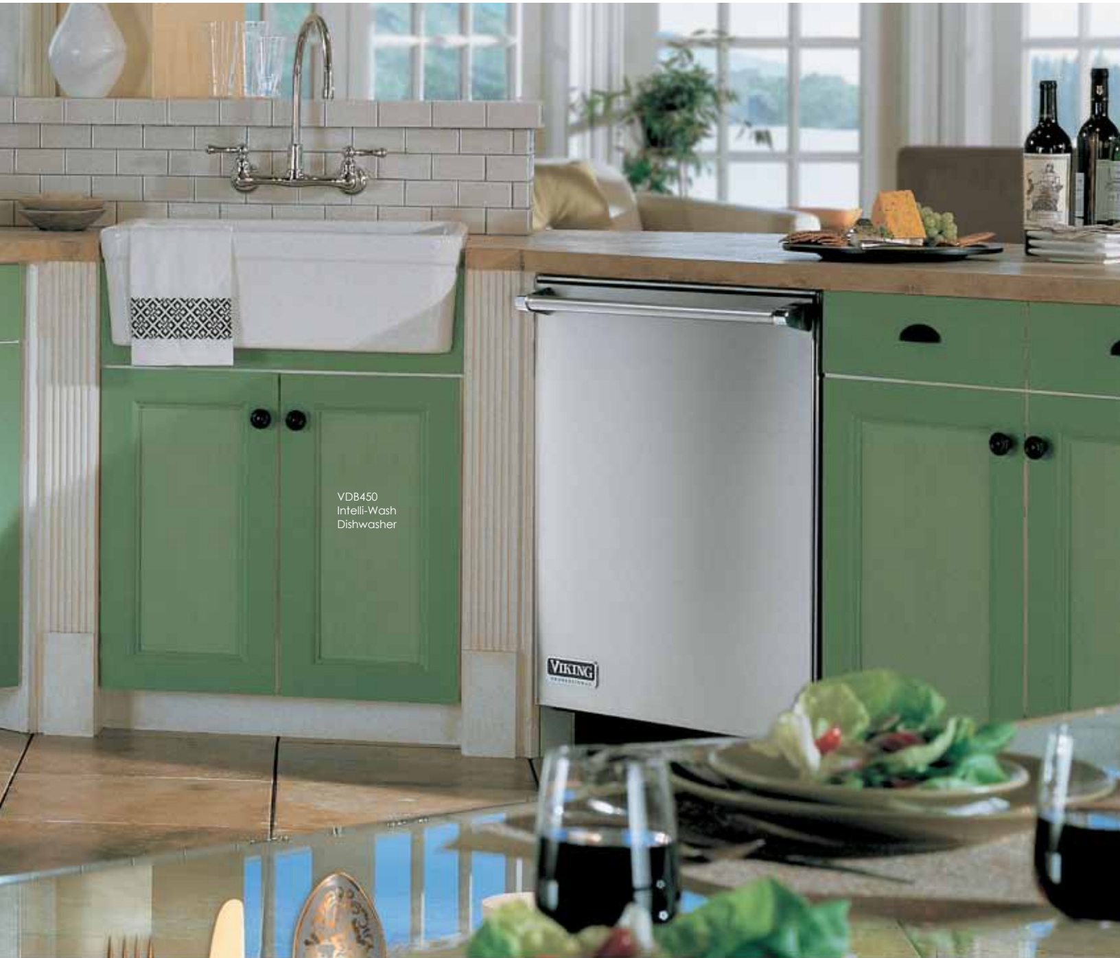
VDB450 Intelli-Wash Dishwasher