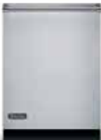
VDB450 Intelli-Wash Dishwasher