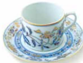
The versatile capacity cradles up to 15 place settings of china.