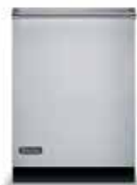
VDB200 Built-In Dishwasher