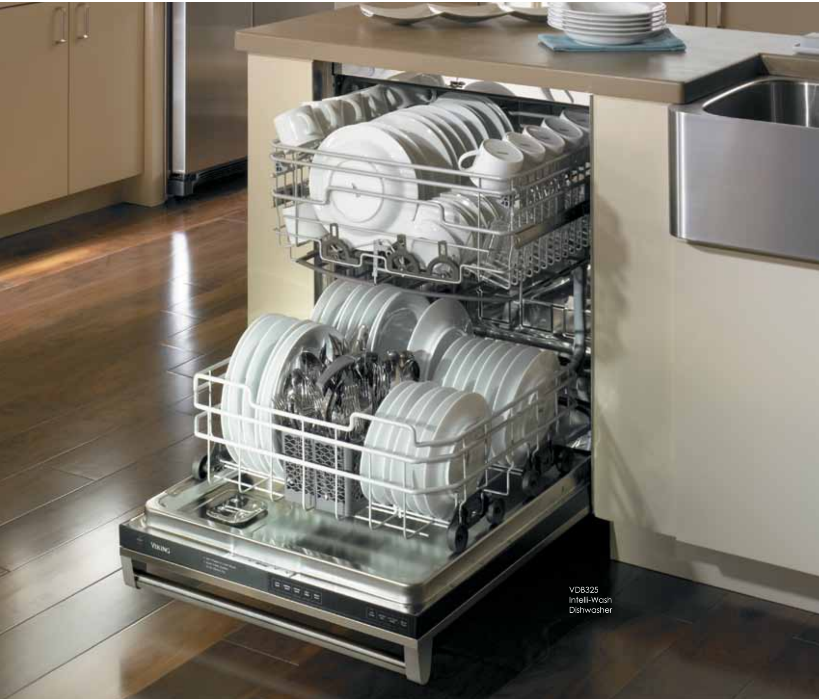
VDB325 Intelli-Wash Dishwasher