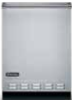
DFB450E Custom Panel Model with PDDPL24 Professional Door Panel