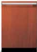
DFB450E Model with Custom Panel