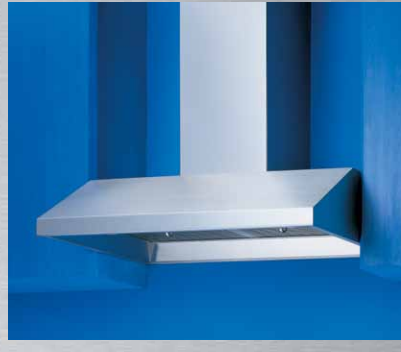
Slim Traditional Wall Hood

30" width – DTWS30491 36" width – DTWS36491 42" width – DTWS42491 48" width – DTWS48491