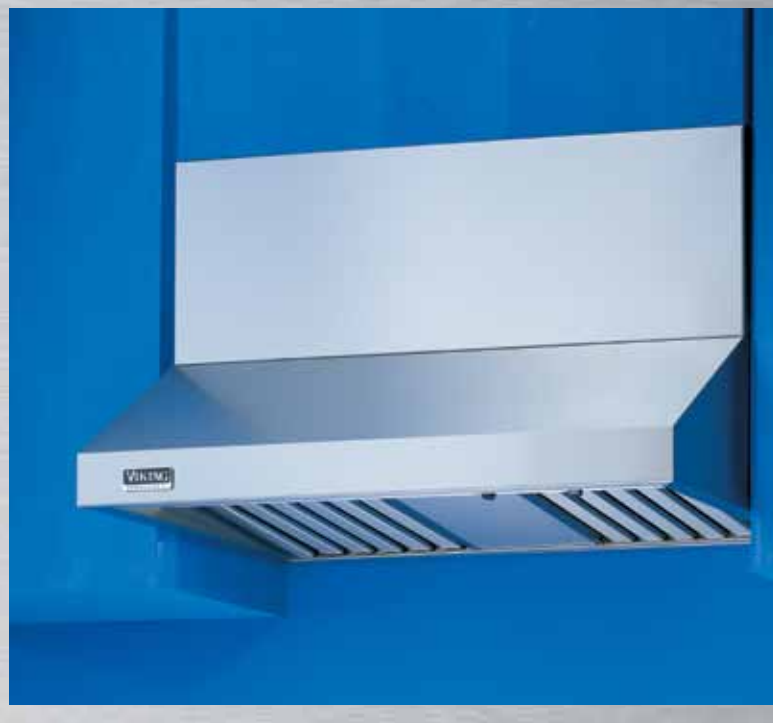
10" High Professional Wall Hood with Standard Interior-Power Ventilator

24" width – VWH2410 30" width – VWH3010 36" width – VWH3610