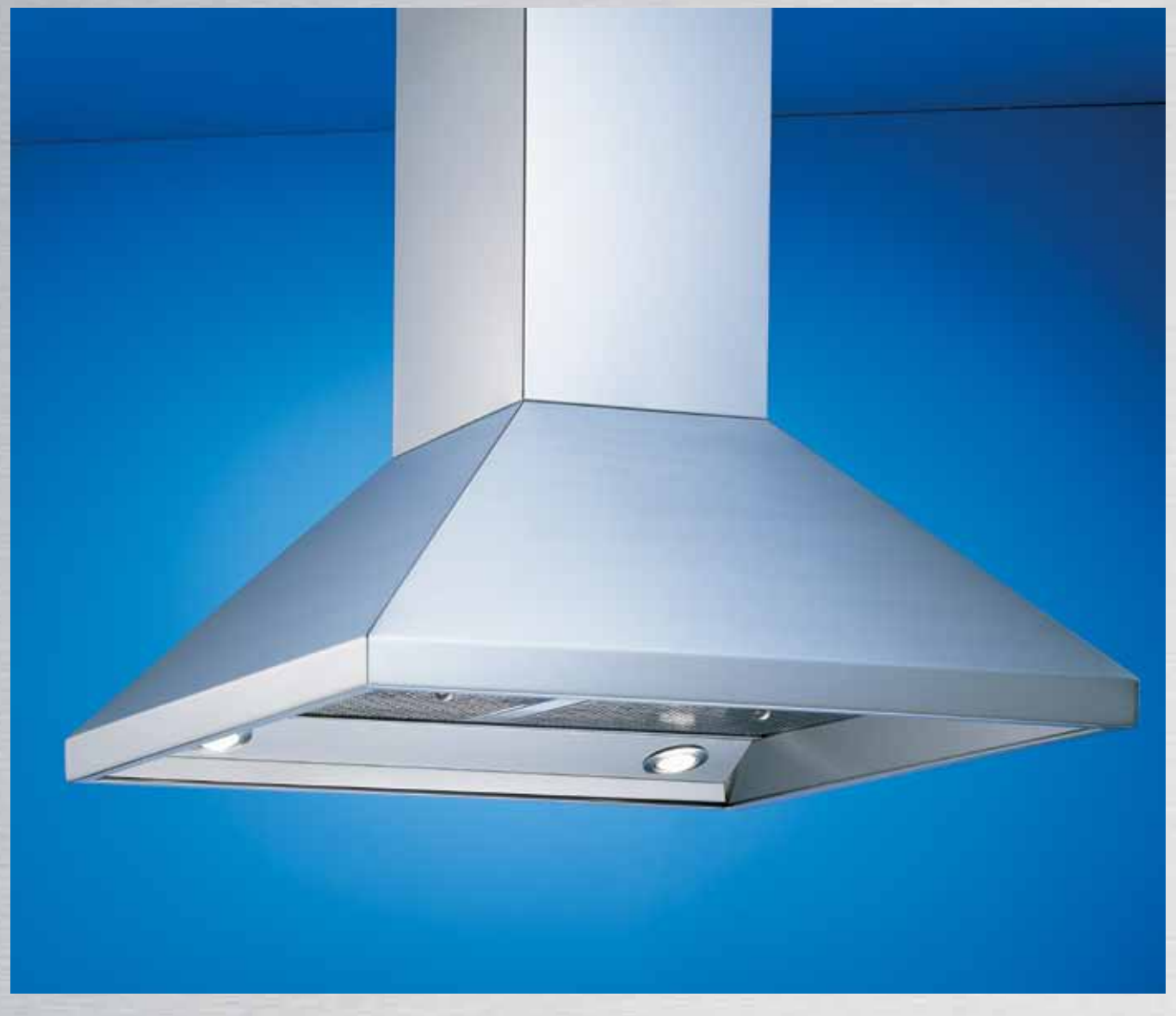
Classic Chimney Island Hood

36" width - DCIH3604 42" width - DCIH4204 54" width - DCIH5404