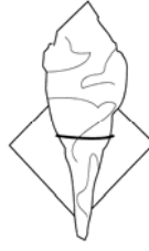
JAK SCONCE Item 41