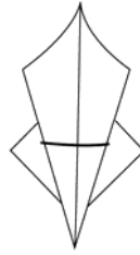
BIG MANI Item 40