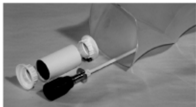
Twist socket parts