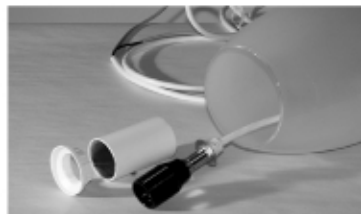
Pod socket parts