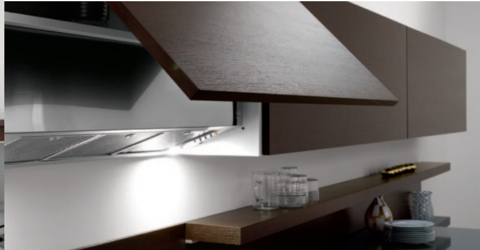
PAG. 20-21 BROWN OAK DOORS, GLOSSY WHITE LACQUER DOOR (BACKGROUND), BROWN TAUPE QUARTZ COUNTERTOPS,