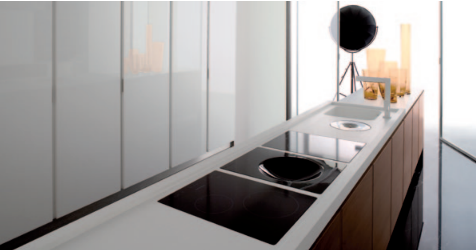
PAG. 14-15-16-17 CANALETTO WALNUT DOORS, GLACIER WHITE CORIAN COUNTERTOPS AND SINK, BLACK PAINTED BUILT-IN HANDLE.