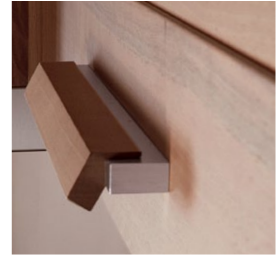
PAG. 68 INTERNAL DRAWERS IN BRUSHED S/STEEL FINISH.