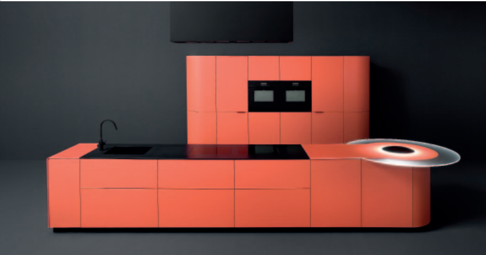
PAG. 3-9 ORANGE LACQUERED FROSTED GLASS DOORS AND COUNTERTOPS, CENTER COUNTERTOP AND SINK IN BLACK CORIAN.