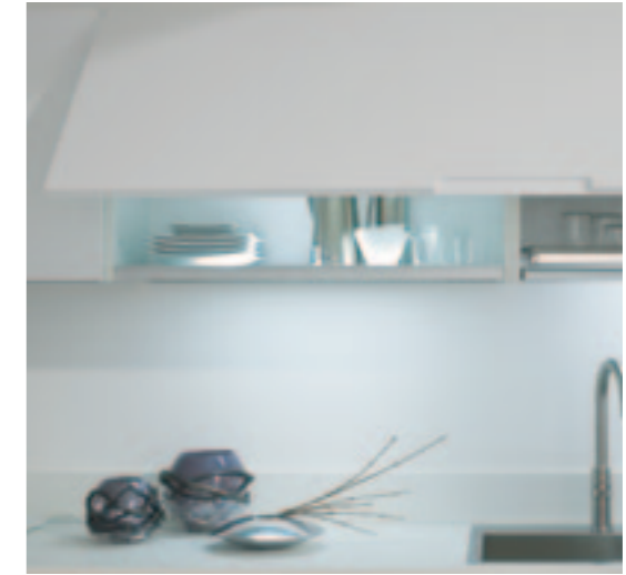
PAG. 90-91 MATTE WHITE POLYMERIC CABINETS, WHITE STONE HPL LAMINATE COUNTERTOP.