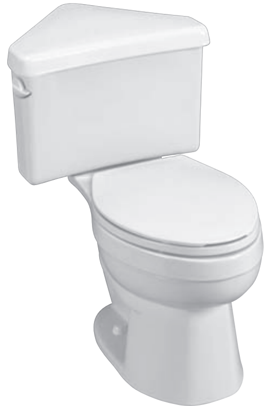
Toilet Seat Shown Not Included