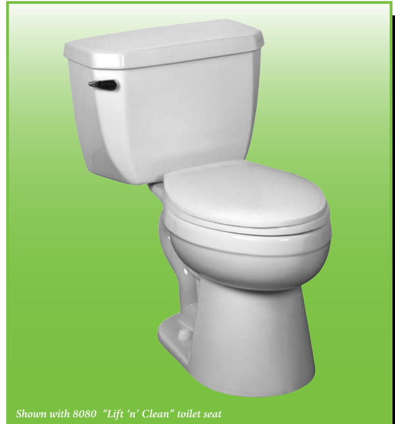
Shown with 8080 "Lift 'n' Clean" toilet seat