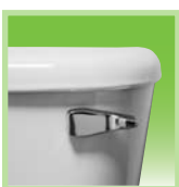
31501 Right hand trip lever

The Green Building / LEED programs was created to provide contractors, building engineers, developers and architects with incentives or rewards for utilizing energy saving and water conservation products in the construction or renovation of their buildings. The LEED program provides points or credits that can be used to offset elements of the construction that would be debits against the property. Using a 1.6 gpf / 6.0 lpf toilets as the baseline, a HET toilet or HEU urinal that has a minimum average water savings of 20% can earn one (1) LEED point, or a minimum water savings of 32% can earn two (2) LEED points.