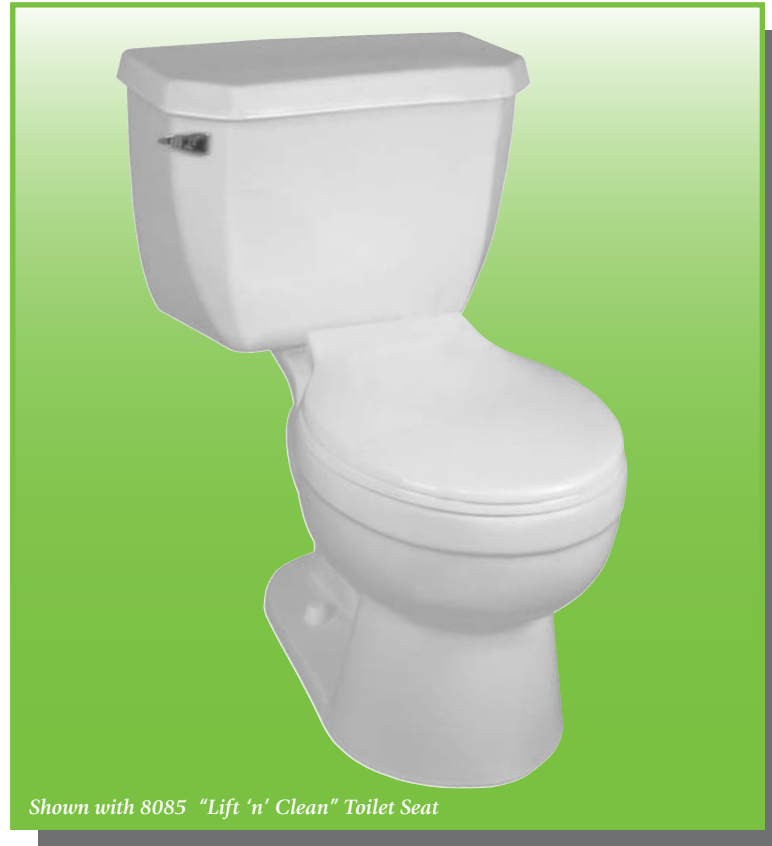
Shown with 8085 "Lift 'n' Clean" Toilet Seat