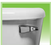
31501 Right hand trip lever

The Green Building / LEED programs was created to provide contractors, building engineers, developers and architects with incentives or rewards for utilizing energy saving and water conservation products in the construction or renovation of their buildings. The LEED program provides points or credits that can be used to offset elements of the construction that would be debits against the property. Using a 1.6 gpf / 6.0 lpf toilets as the baseline, a HET toilet or HEU urinal that has a minimum average water savings of 20% can earn one [1] LEED point, or a minimum water savings of 32% can earn two [2] LEED points.