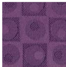
Martini FVL Cosmopolitan