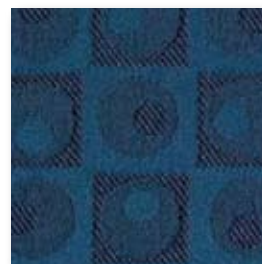
Martini FVP On The Rocks