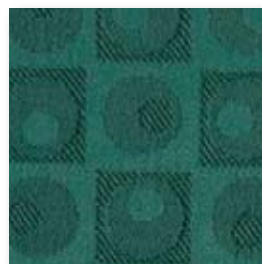
Martini FVK Vermouth