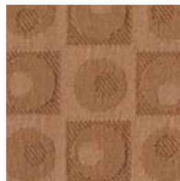
Martini FVJ Vesper