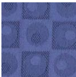
Martini FVG Cocktail