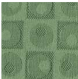
Martini FVF Olive