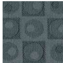
Martini FVM Classic