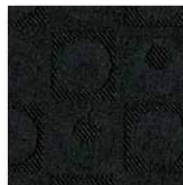
Martini FVQ Black Tie