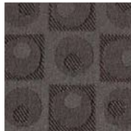
Martini FVH Straight Up