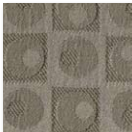
Martini FVD Shaken