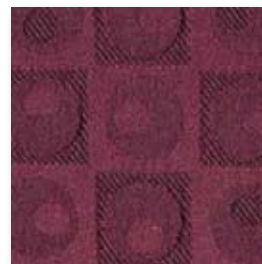
Martini FVN Swizzle Stick