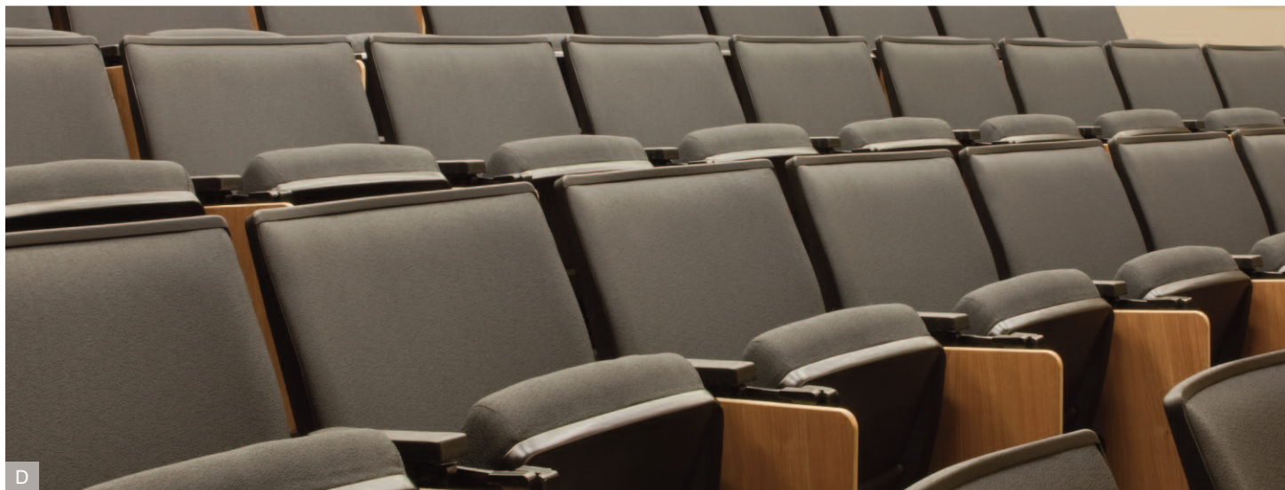
C/D: Crisp contemporary lines of both Focus and Stellar blend perfectly with the modern design of RBS' new building.