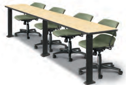
Focus Fixed Table with Acton Caster