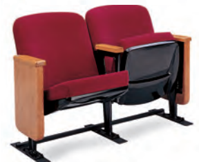
Shoes and Stretchers

Spirit and Stellar models are both available with "shoes and stretchers," an option that allows for a row of chairs to be removed quickly to provide more room when required.