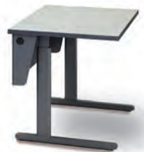
Parley Height Adjustable Table