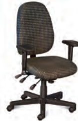
Cue 3 Full Back