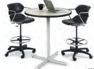
42" H Café Table Credence X-Base