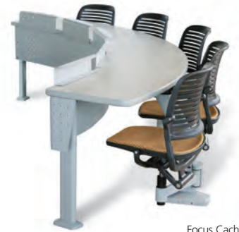
Focus Cachet® Swing-Away