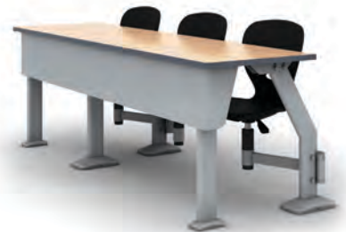
Focus Nota Swing-Away