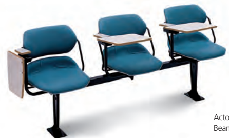
Acton 275 Beam Mount