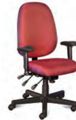
Cue 3 High Back