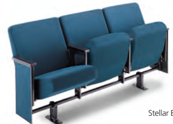
Stellar Beam Mount

Acton® , Dimension and Stellar® beam-mounts create an orderly appearance in any classroom. The unique mounting option also allows for easy facility cleaning.