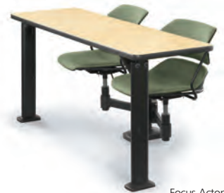
Focus Acton® Swing-Away