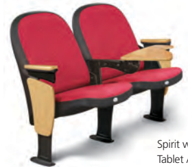
Spirit with Tablet Arm

New technology and materials make Spirit cost-effective and easy to install. Available in a variety of finishes and with two sizes of tablet arms, Spirit is an economical and modern solution for auditoriums.