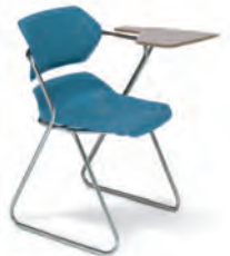
Acton Tablet Arm

Available with both a regular and a heavy-duty option, in standard and oversized tablet arms, these tablet arm models are ideal for note taking and laptop use.