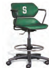
Acton Stool with logo