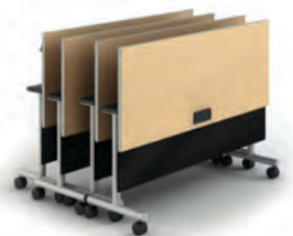
Parley Mobile Flip and Nest Table

Endless options allow for unique surroundings: a variety of shapes, table bases and modesty panels name just a few of the things that can be paired with this table collection.