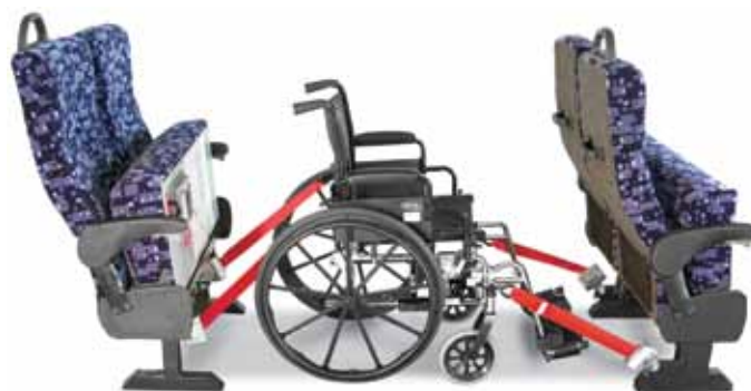
(Shown with Model 2095)

Mobility aid securement for passengers in wheelchairs is safe, quick and easy with slider-seats incorporating integrated auto-locking restraint belts.