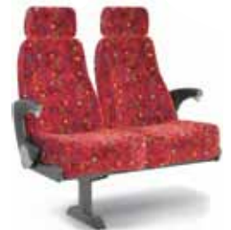
2000 Series (2004 shown)

Each model features high-strength fatigue-resistant, powder-coated steel frames with t-pedestal mountings. Choose from a wide range of sculpted cushion and back packages, upholstery and accessory options to customize a seating solution.