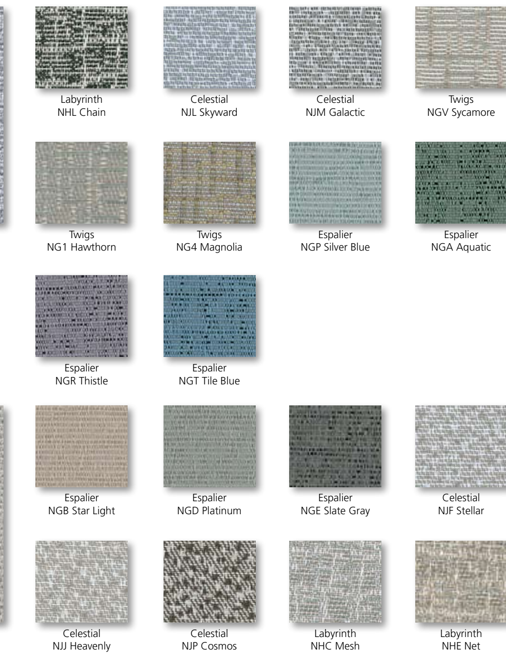
Espalier NGC Sky Gray