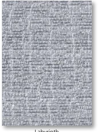
Labyrinth NHJ Screen