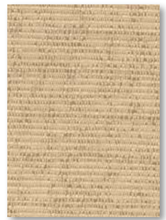
Espalier NGF Corn Silk