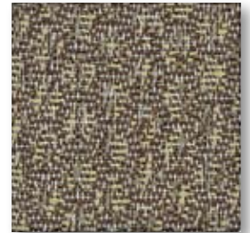
Imprint NHX Fossil