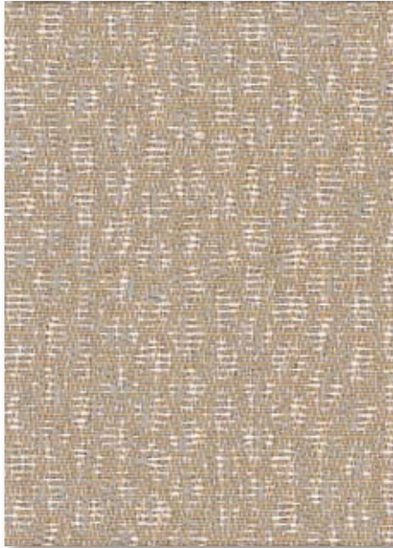
Imprint NHM Shell