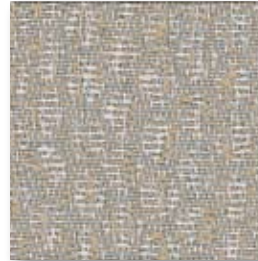
Imprint NHP Calcite