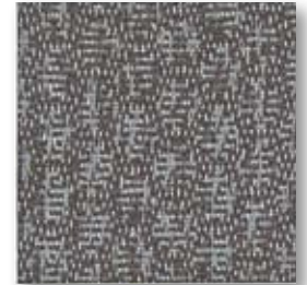
Imprint NH1 Cave