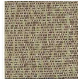
Imprint NHW Miocene