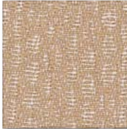
Imprint NHN Trace