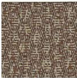
Imprint NHY Celestite