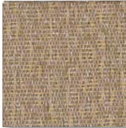
Imprint NHR Mineral