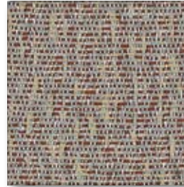
Imprint NHT Relic