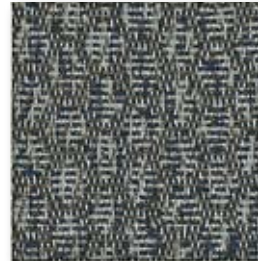
Imprint NH0 Coal