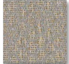
Imprint NHU Neolith