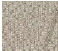
Meander NFT Overcast E