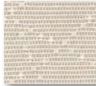
Tracery NF6 Egret E