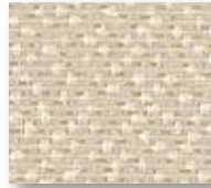
Universe NFX Cremé Brûlée E