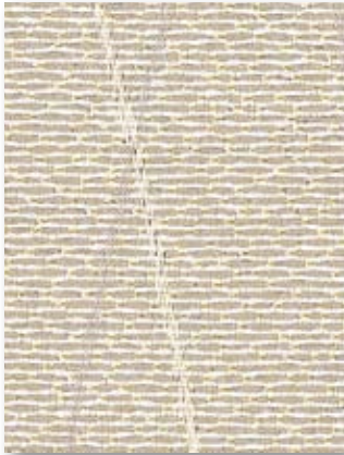
Meander NFR Sandshell E