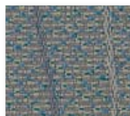
Meander NFW Nightshadow E