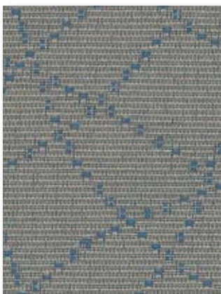
Tracery NF9 Seaspray E