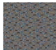
Universe NF5 Depth E