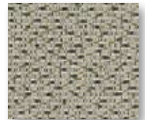
Universe NF1 Seneca E