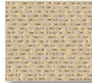
Universe NFO Wheat E