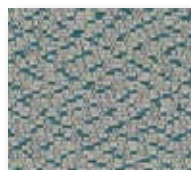
Universe NF4 Cosmic E