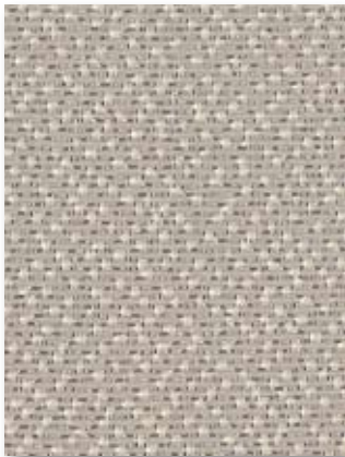
Universe NFY Whitecap E