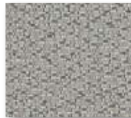
Universe NF3 Mica E