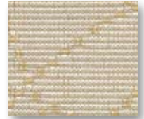
Tracery NF7 Straw E