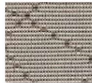
Tracery NF8 Brindle E