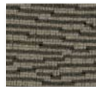
Drift NDY Graphite E