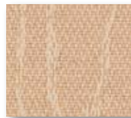
Coastline ND4 Sunset E