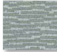
Drift NDV Dusty Miller E