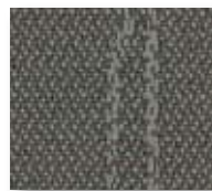
Coastline NEC Seal E