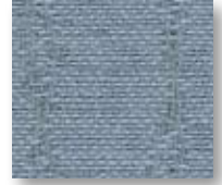
Coastline NEA Vapor E