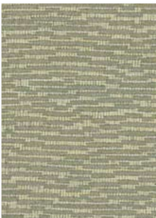
Drift NDW Sprout E