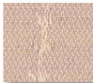
Coastline ND2 Coral E