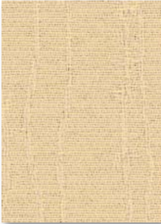
Coastline ND3 Meringue E