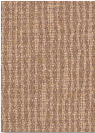
Groove NDE Rum E