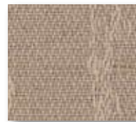
Coastline ND8 Bluff E