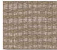
Groove NDL Mocha E