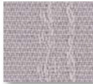
Coastline ND6 Lilac E