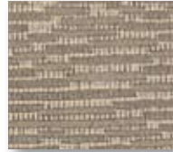
Drift NDU Mocha E