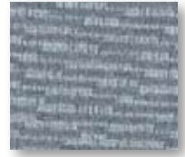
Drift NDX Slate E