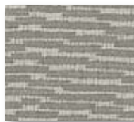
Drift NDT Pebble E