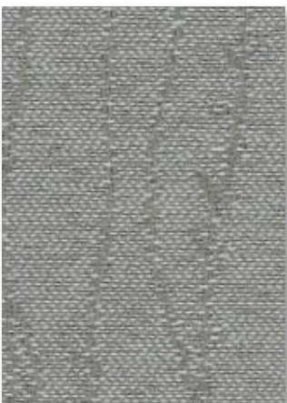
Coastline NEB Dove E