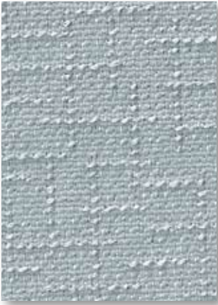
Crosstown JBD Sterling E