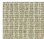
Groove NDM Spring E