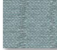
Coastline ND9 Bluegrass E