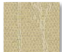
Coastline ND7 Limeade E