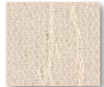
Coastline ND1 Sand E