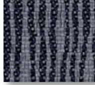
Groove NDP Starlight E