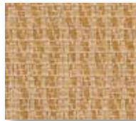
Groove NDJ Marigold E