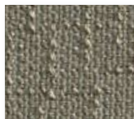
Crosstown JBF Cement E