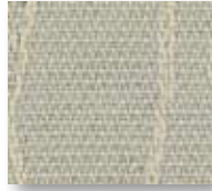
Coastline ND0 Beach Glass E