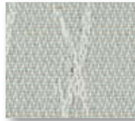
Coastline ND5 Gull E