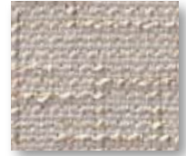
Crosstown JBA Stucco E