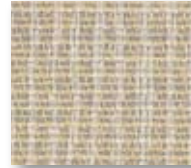
Groove NDG Froth E