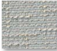
Crosstown JBB Fieldstone E