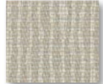
Groove NDH Winter E