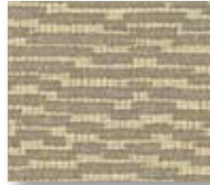
Drift NDQ Chamois E