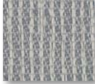
Groove NDF Smoke E