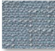
Crosstown JBG Waterfront E