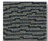
Drift NDZ Storm E