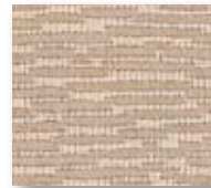
Drift NDR Alabaster E