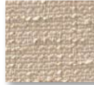
Crosstown JBC Buff E