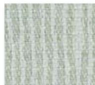
Groove NDK Mist E