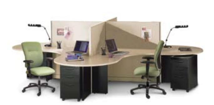
Framework Access® system