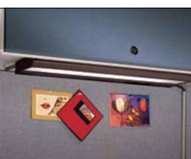
Overhead tasklighting (Light is available in black only.)