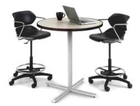
42" H Café table Credence X-Base