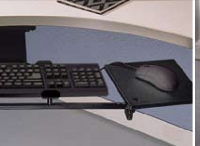
Ergonomic keyboard trays and mouse pads