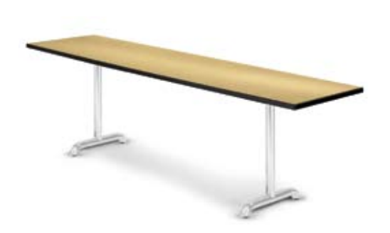
Parley® table Brilliance T-Legs