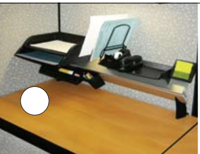
Slatwall tool bars and organizational tools